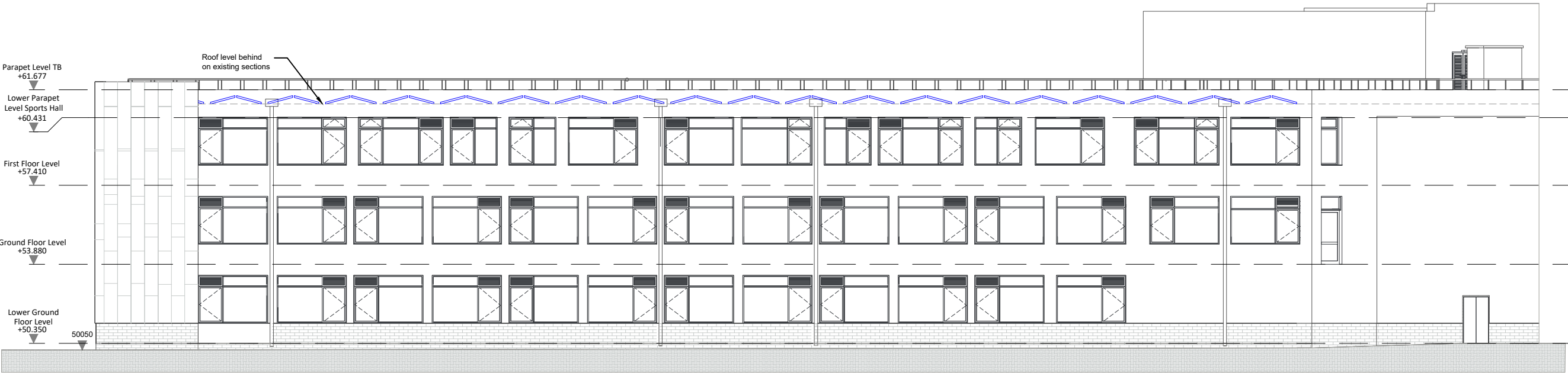
Proposed: South Lissenden Gardens Elevation