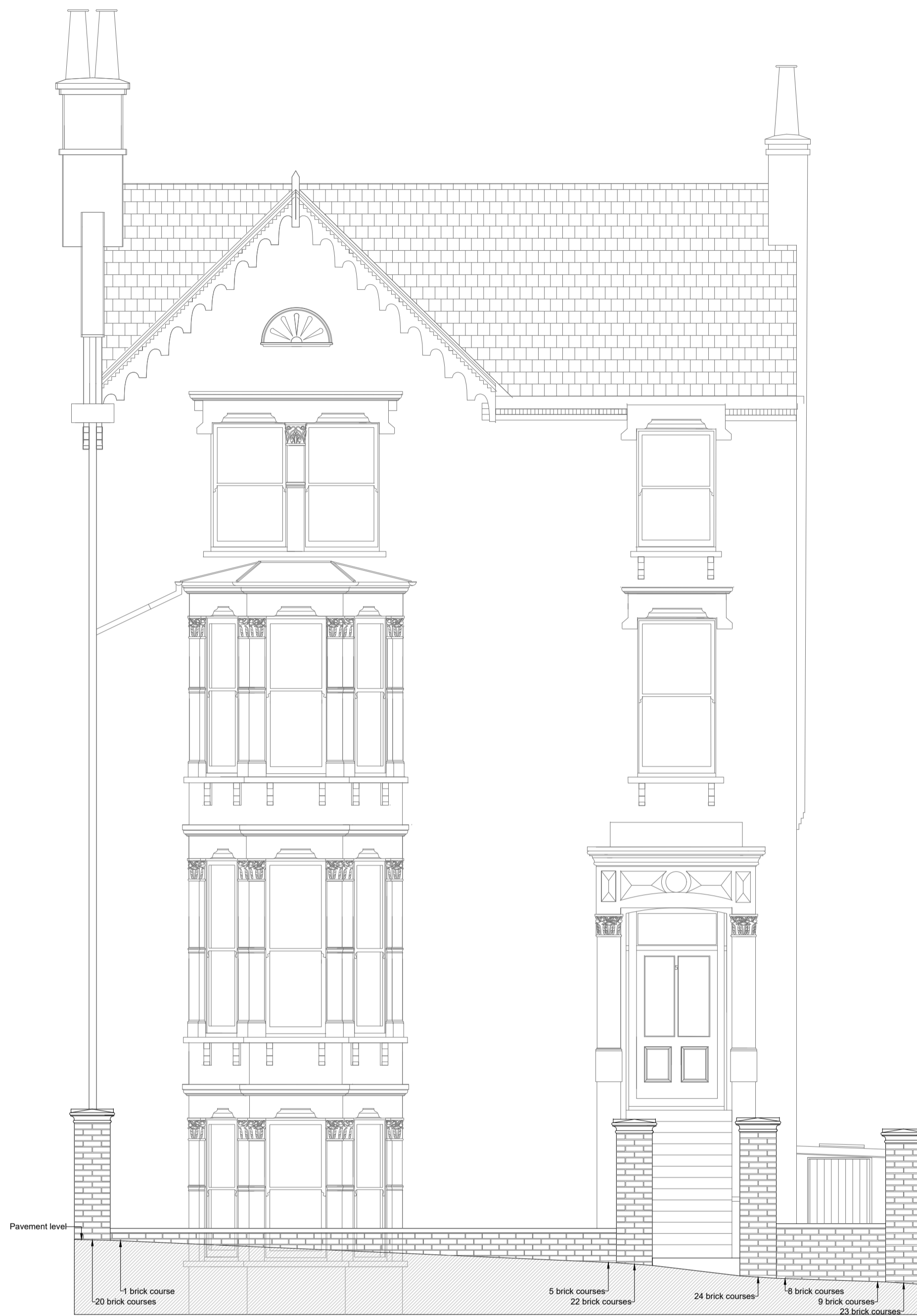
1 - Existing - Front Elevation Scale 1:50