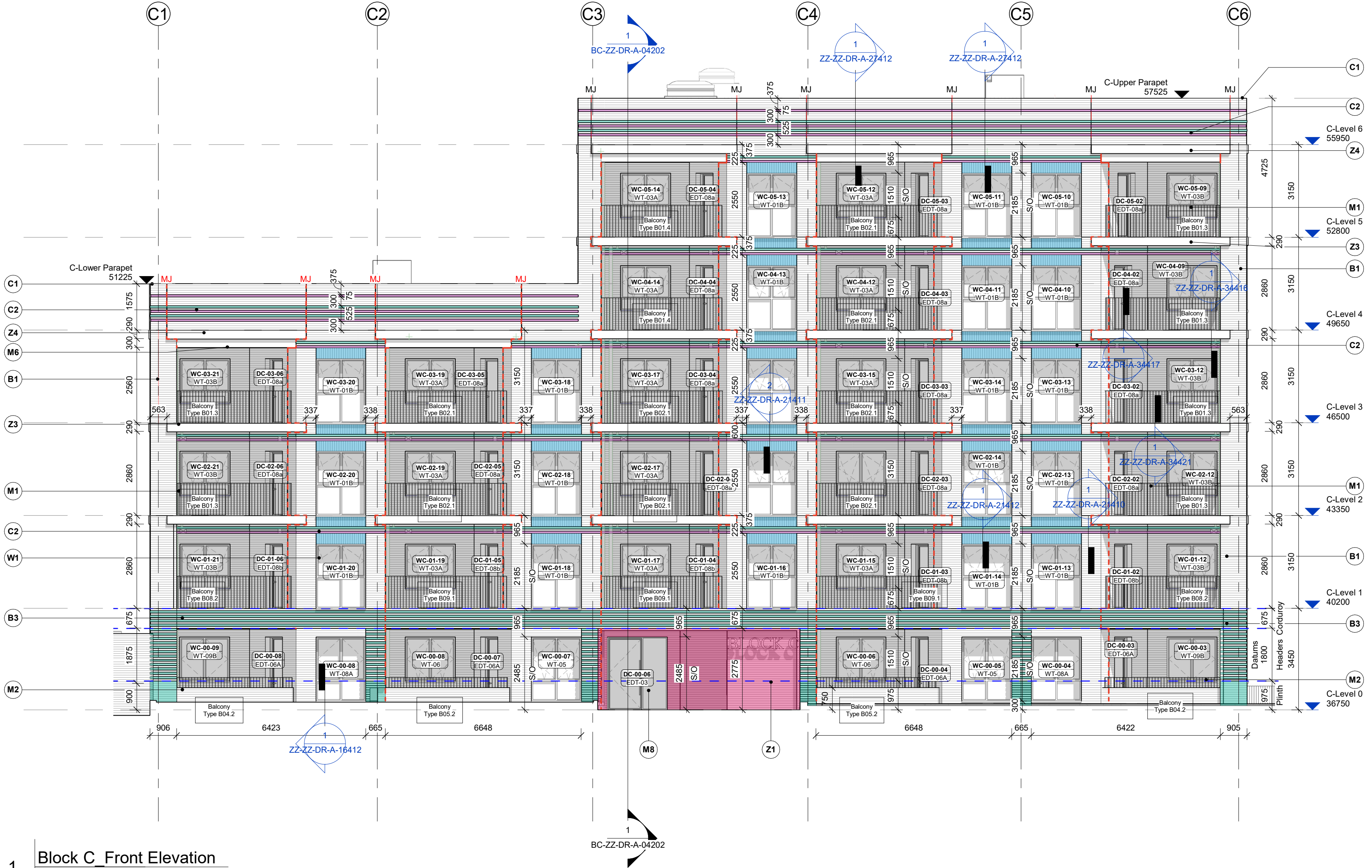
1 Block C Front Elevation Scale: 1 : 100