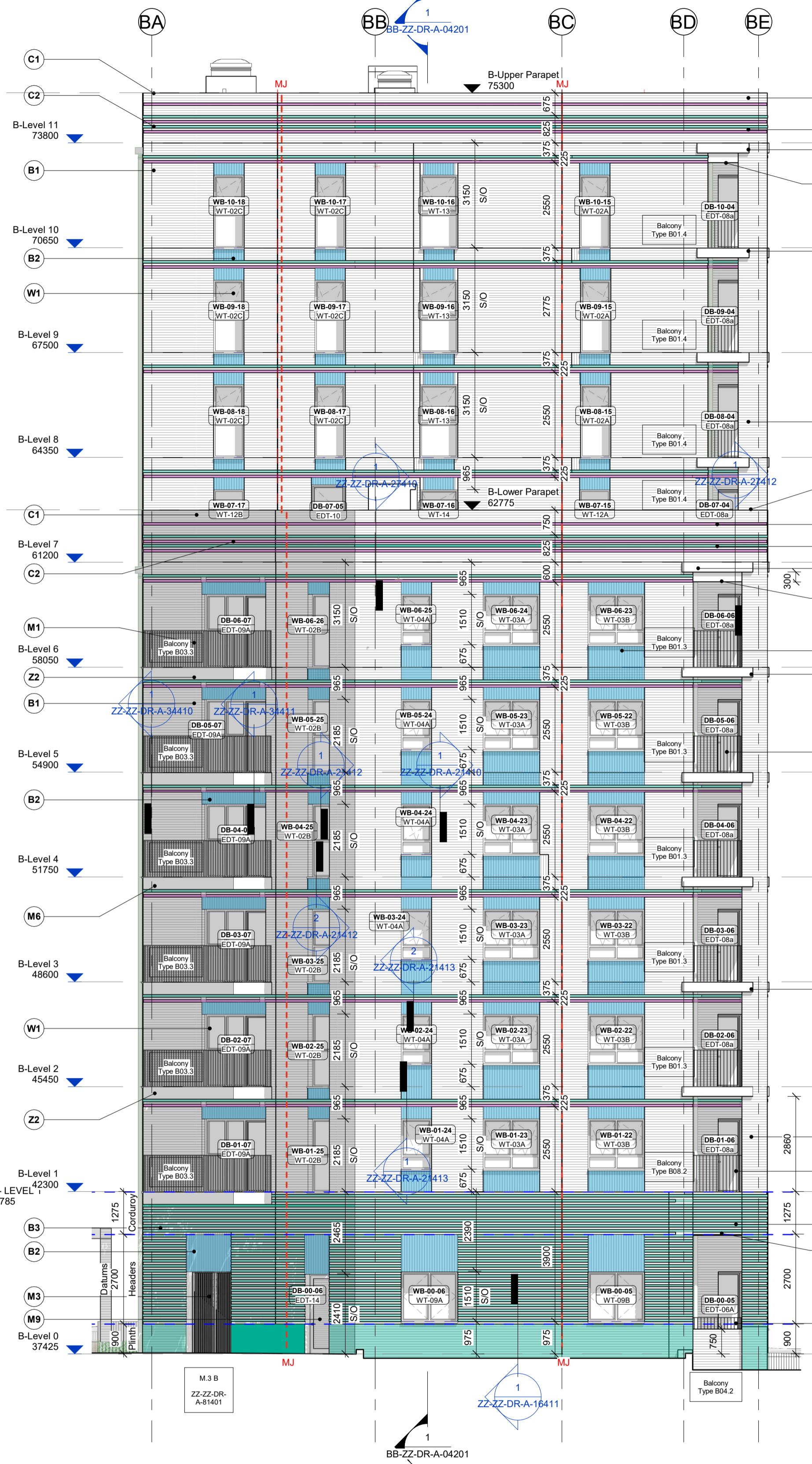
2 Block B Side B Elevation Scale: 1:100