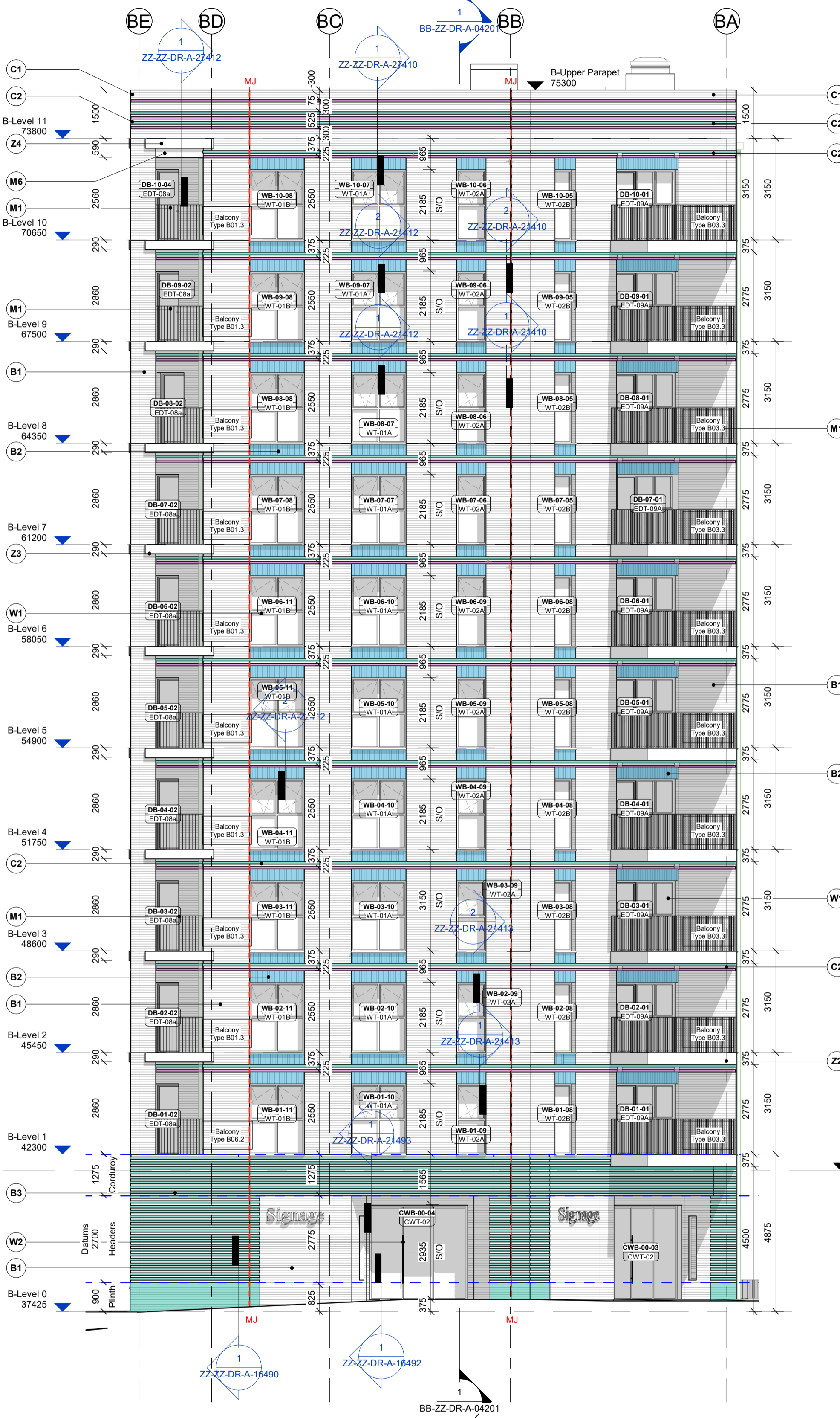
1 Block B Side A Elevation Scale: 1:100