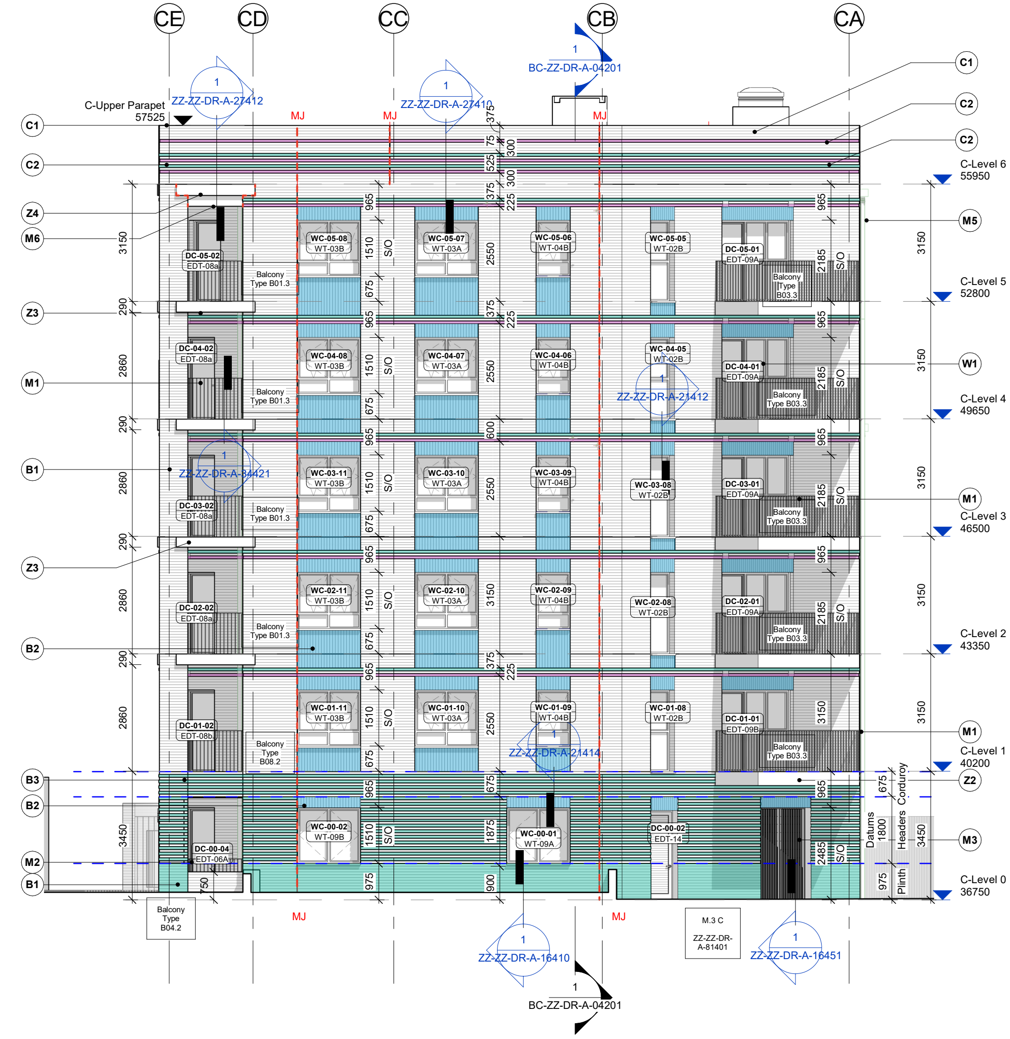
1 Block C Side A Elevation Scale: 1 : 100