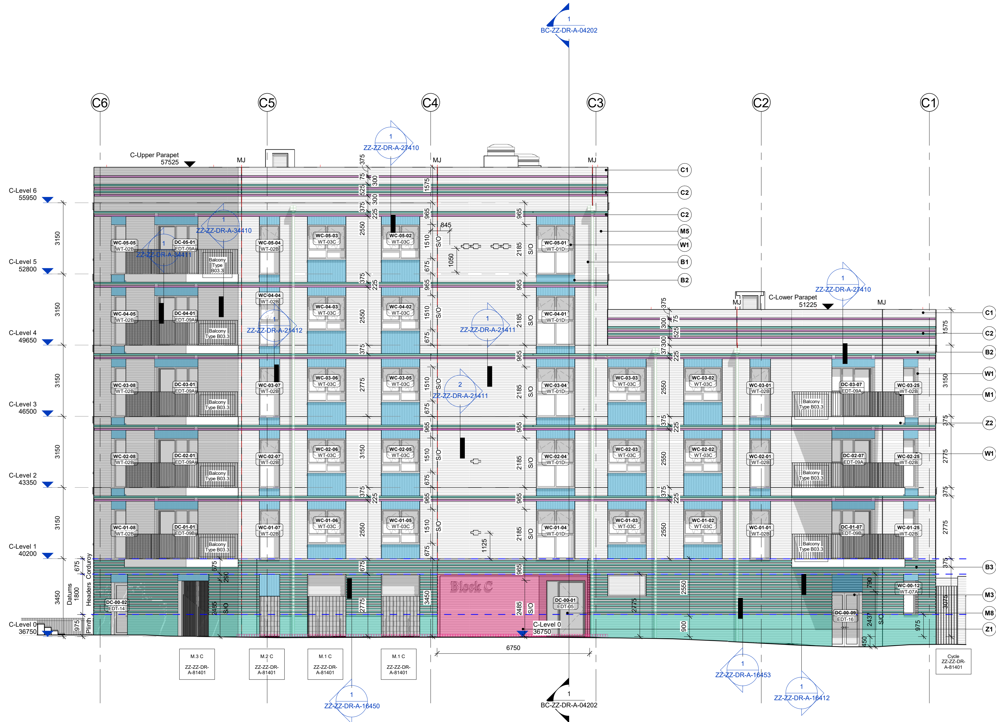
Block C Rear Elevation Scale: 1 : 100

Block C Elevations - Sheet 2 ARP3- PTE- BC-ZZ-DR-A-05302 P4 S4