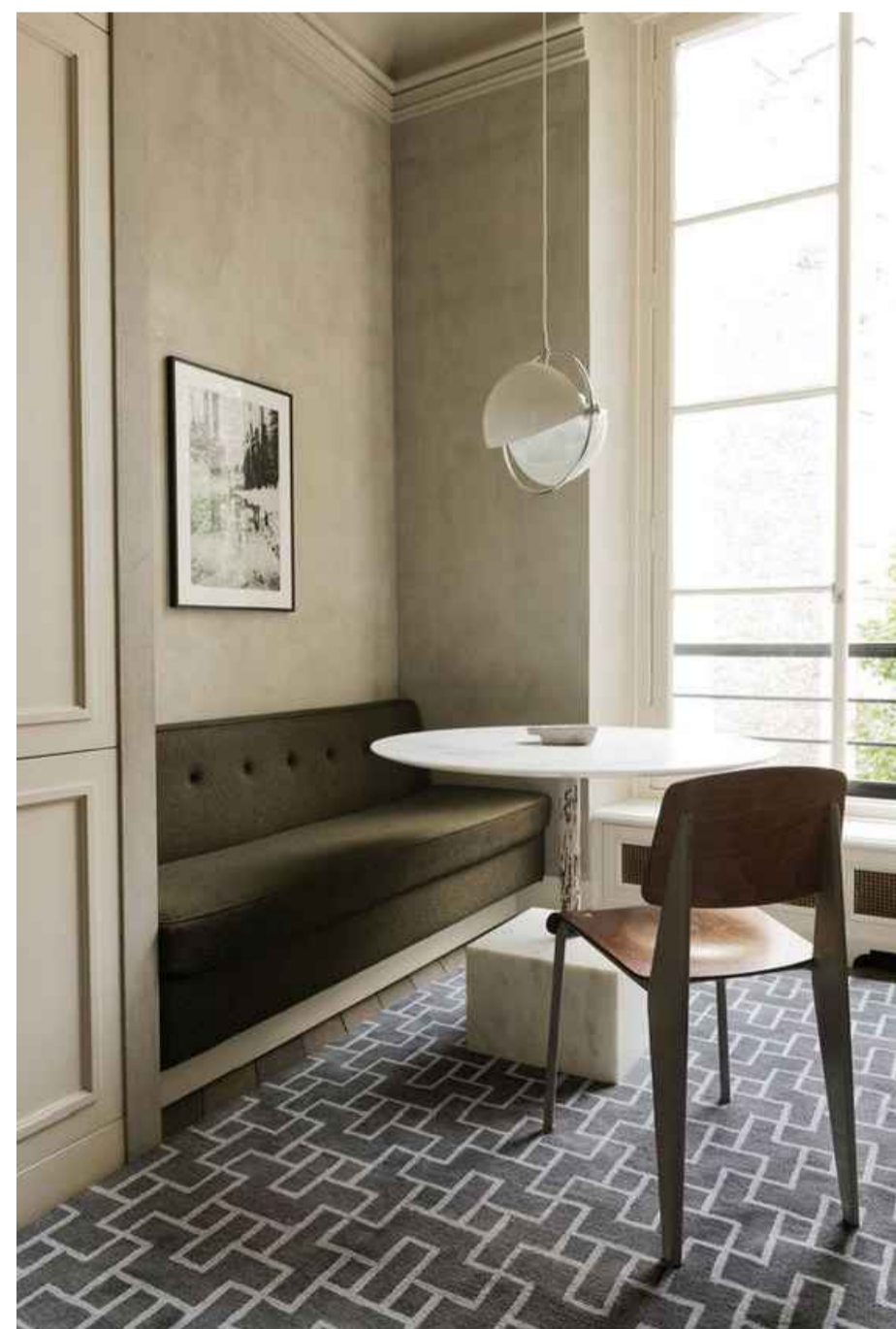
4 Banquette Precedent Image SCALE 1:na

NOTES DO NOT SCALE FROM THIS DRAWING. ALL DIMENSIONS TO BE CHECKED ON SITE. ALL OMISSIONS AND DISCREPANCIES TO BE REPORTED TO THE ARCHITECT IMMEDIATELY. ALL RIGHTS RESERVED. THIS WORK IS COPYRIGHT AND CANNOT BE REPRODUCED OR COPIED OR MODIFIED IN ANY FORM OR BY ANY MEANS, GRAPHIC ELECTRONIC OR MECHANICAL, INCLUDING PHOTOCOPYING WITHOUT THE WRITTEN PERMISSION OF KIM PARTRIDGE INTERIORS