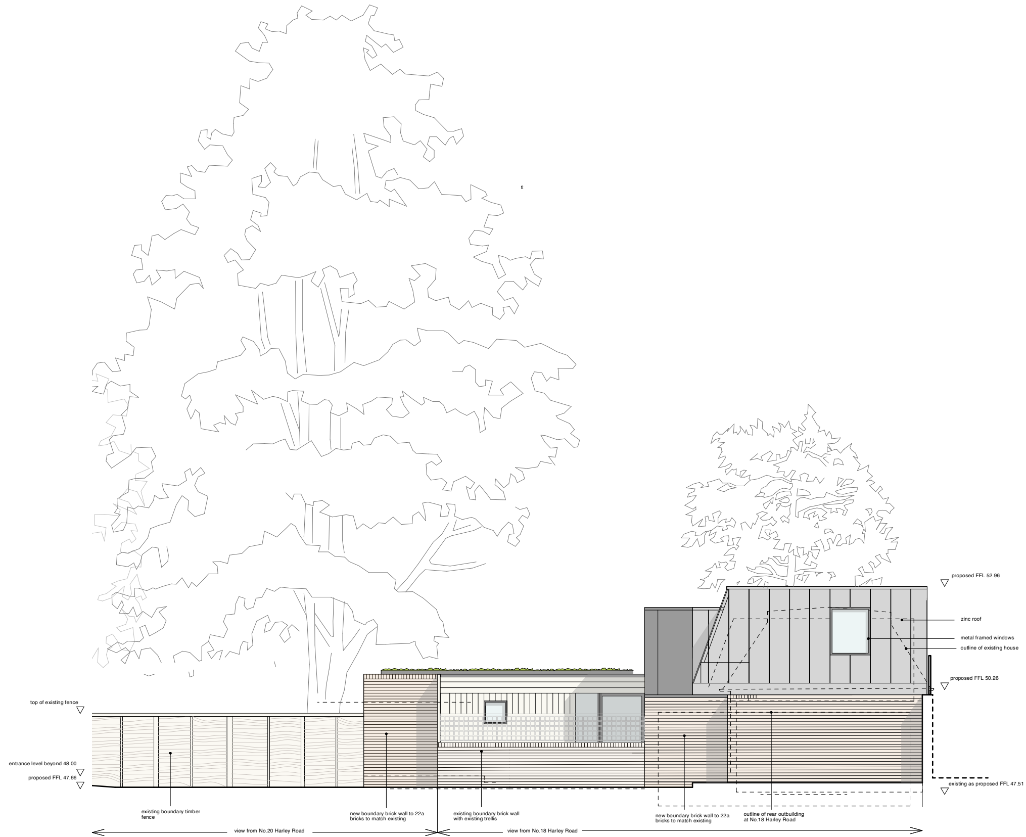
01 North Elevation scale 1:100

THEIS + KHAN 11-13 Lonsdale Gardens Tunbridge Wells Kent TN11 1NU +44 (0)1892 518094 mail@theisandkhan.com www.theisandkhan.com