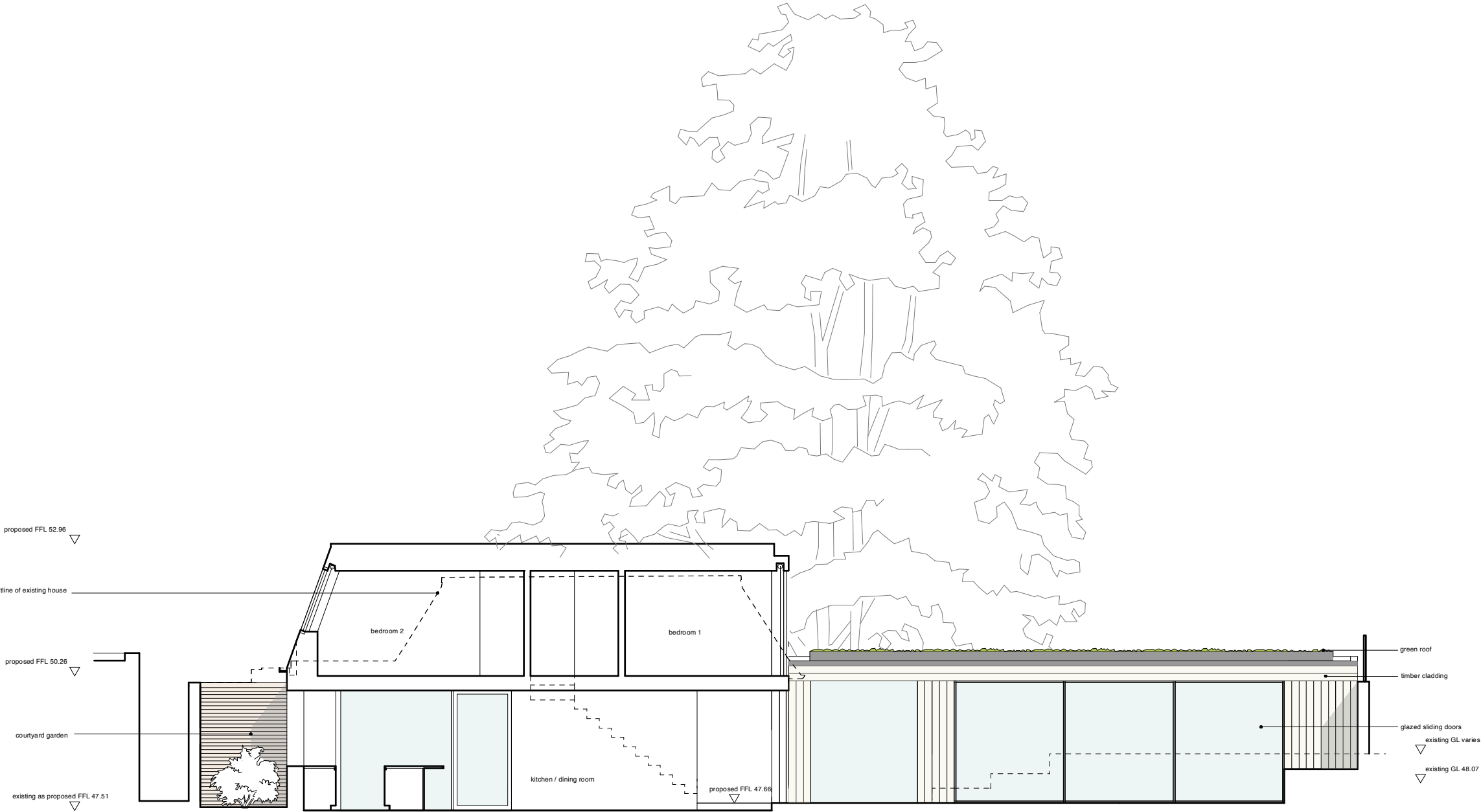
01 | Section CC West Elevation scale 1:100