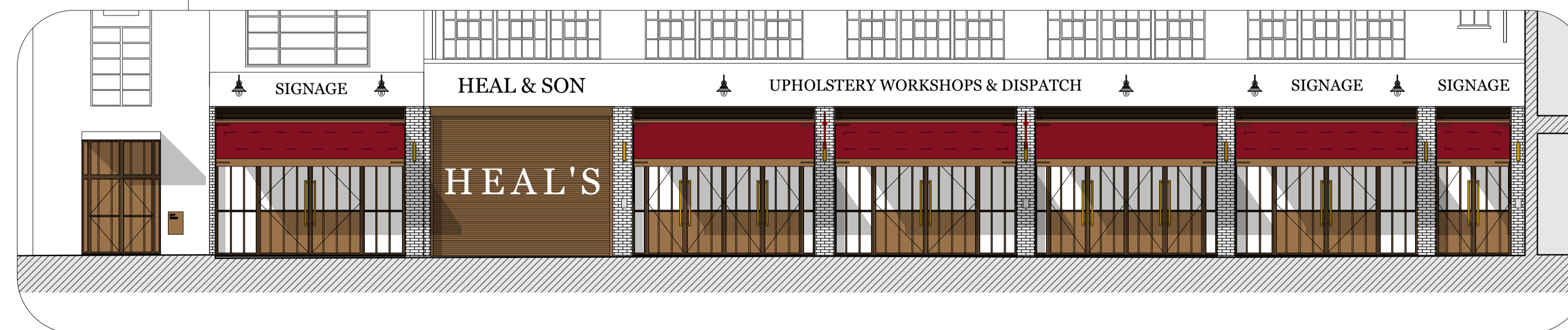
Proposed Alfred Mews Elevation with protracted awnings