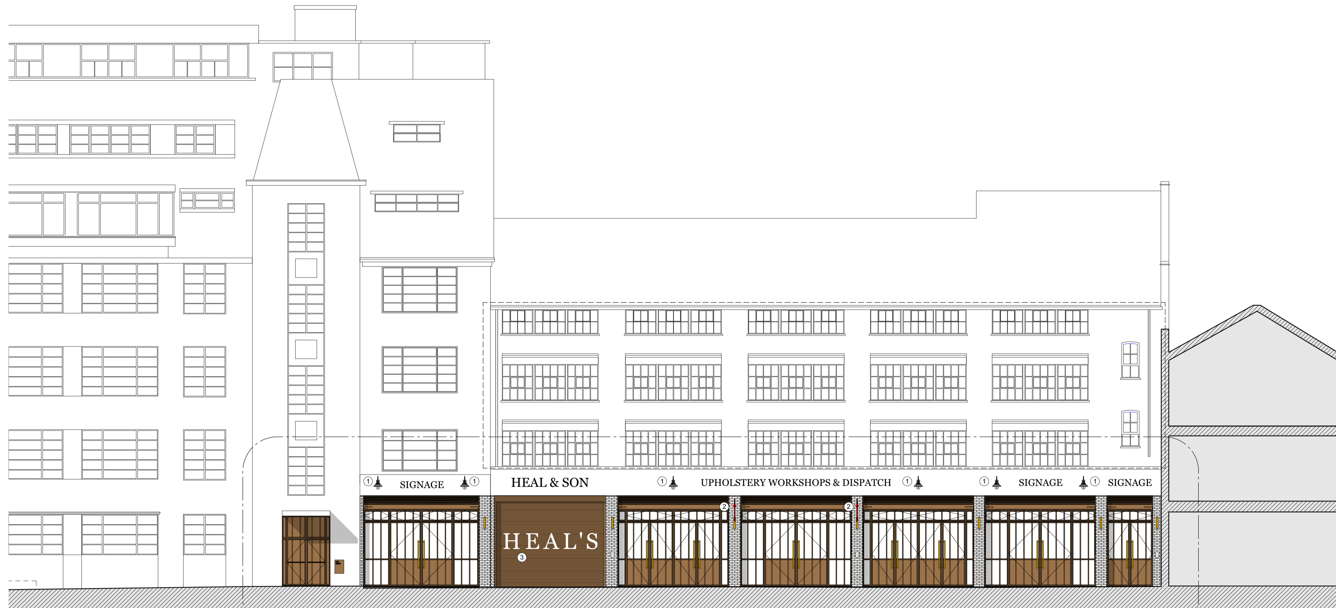
3 Proposed Alfred Mews Elevation Scale: 1:100