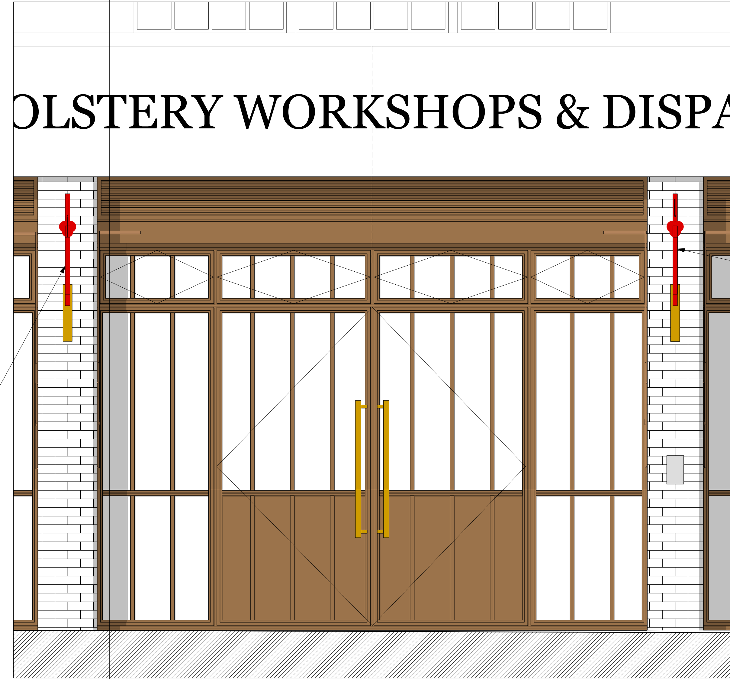
02 Alfred Mews Elevation Scale: 1:20

New Hanging Sign Material: Painted Metal Background Colour: Bright Red (RAL 3028) Text/Logo Colour: Pure White (RAL 9010)