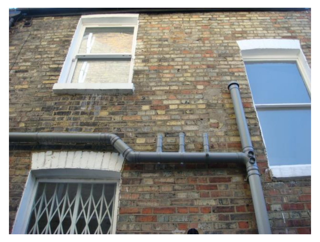
REAR OF 65 REGENTS PARK ROAD