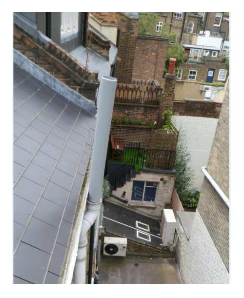
REAR 65 REGENTS PARK ROAD