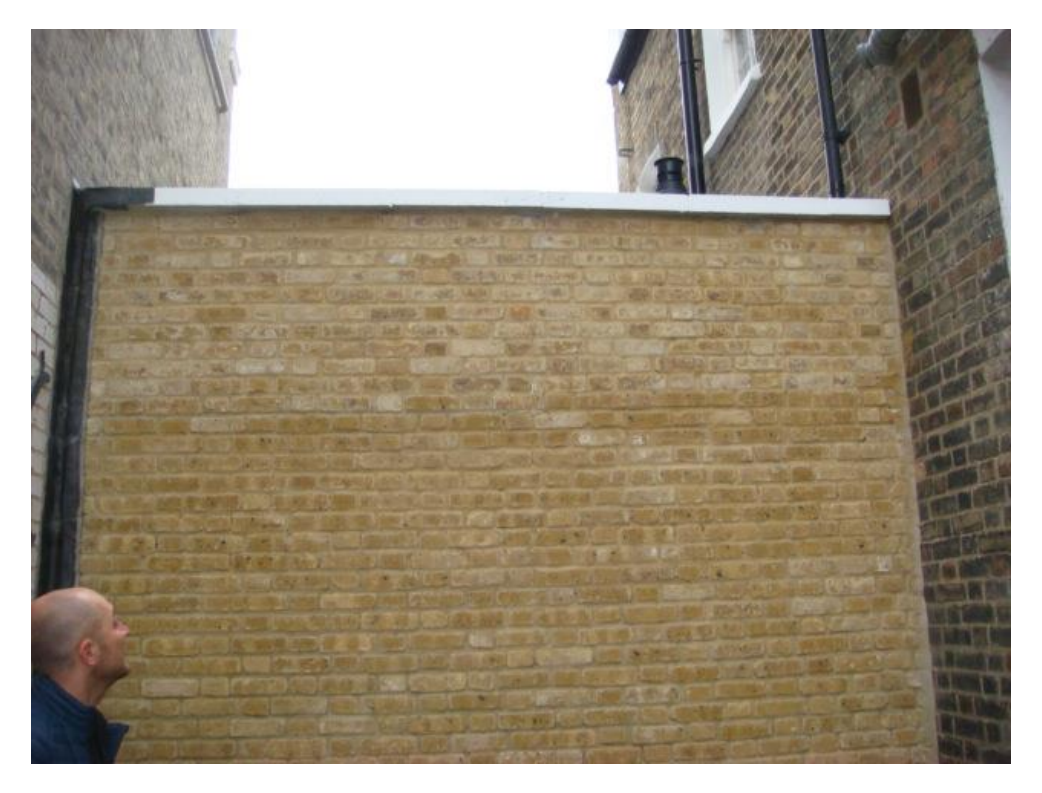
REAR 65 REGENTS PARK ROAD LOOKING EAST (showing rear extension to 67 Regents Park Road)