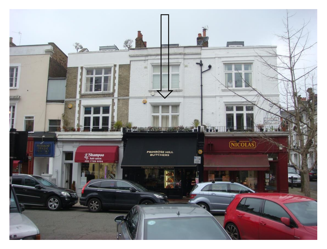
FRONT ELEVATION – 65 REGENTS PARK ROAD