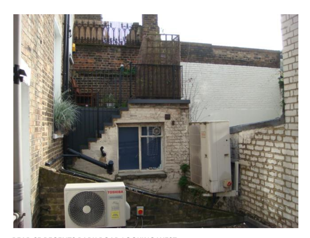
REAR 65 REGENTS PARK ROAD LOOKING WEST