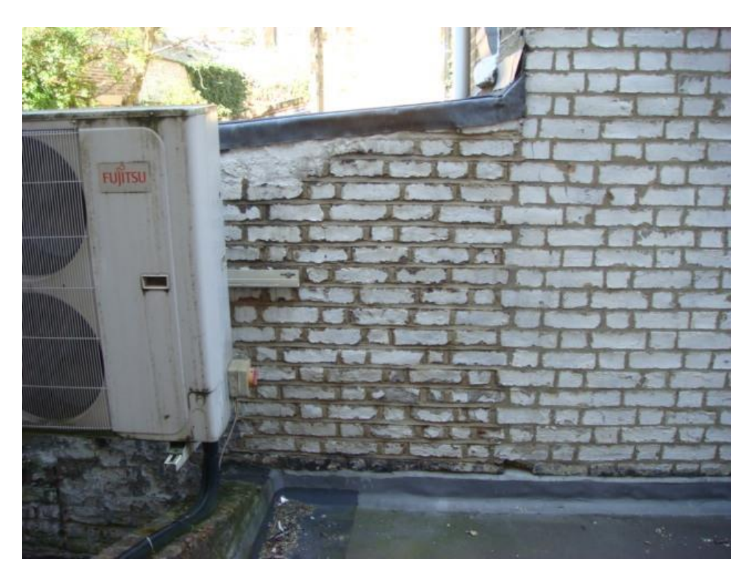
OPPOSITE WALL TO REAR OF 65 REGENTS PARK ROAD