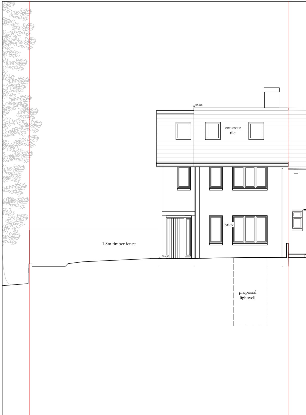
Proposed elevation: North