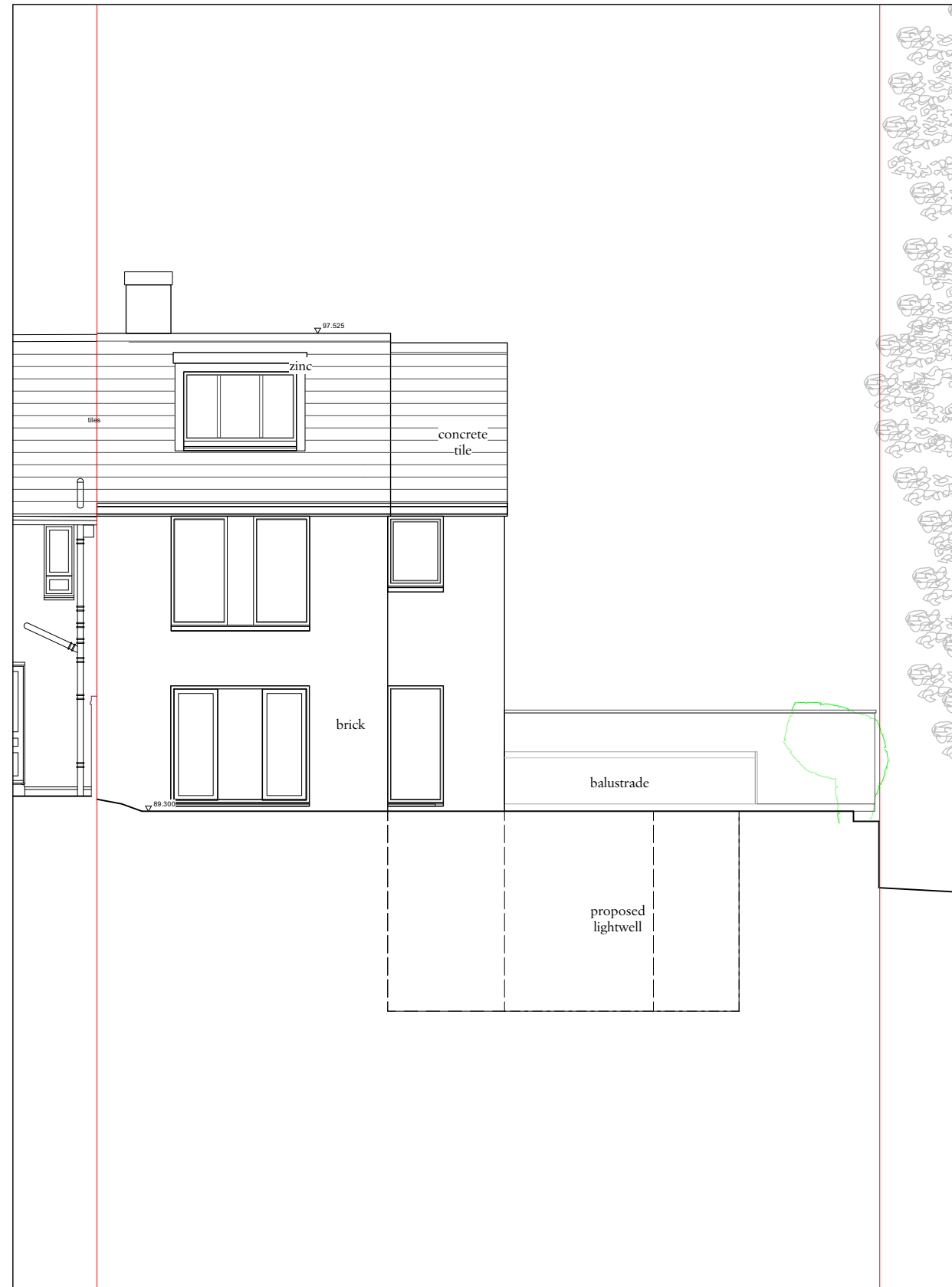
Proposed elevation: South