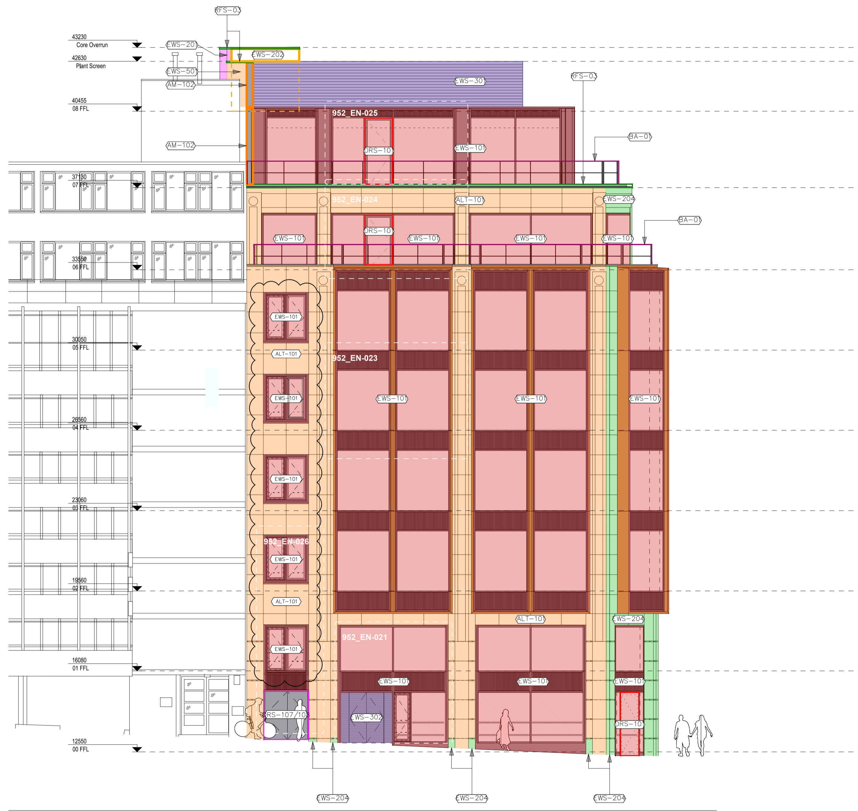
1 Proposed South Elevation Scale: 1:100