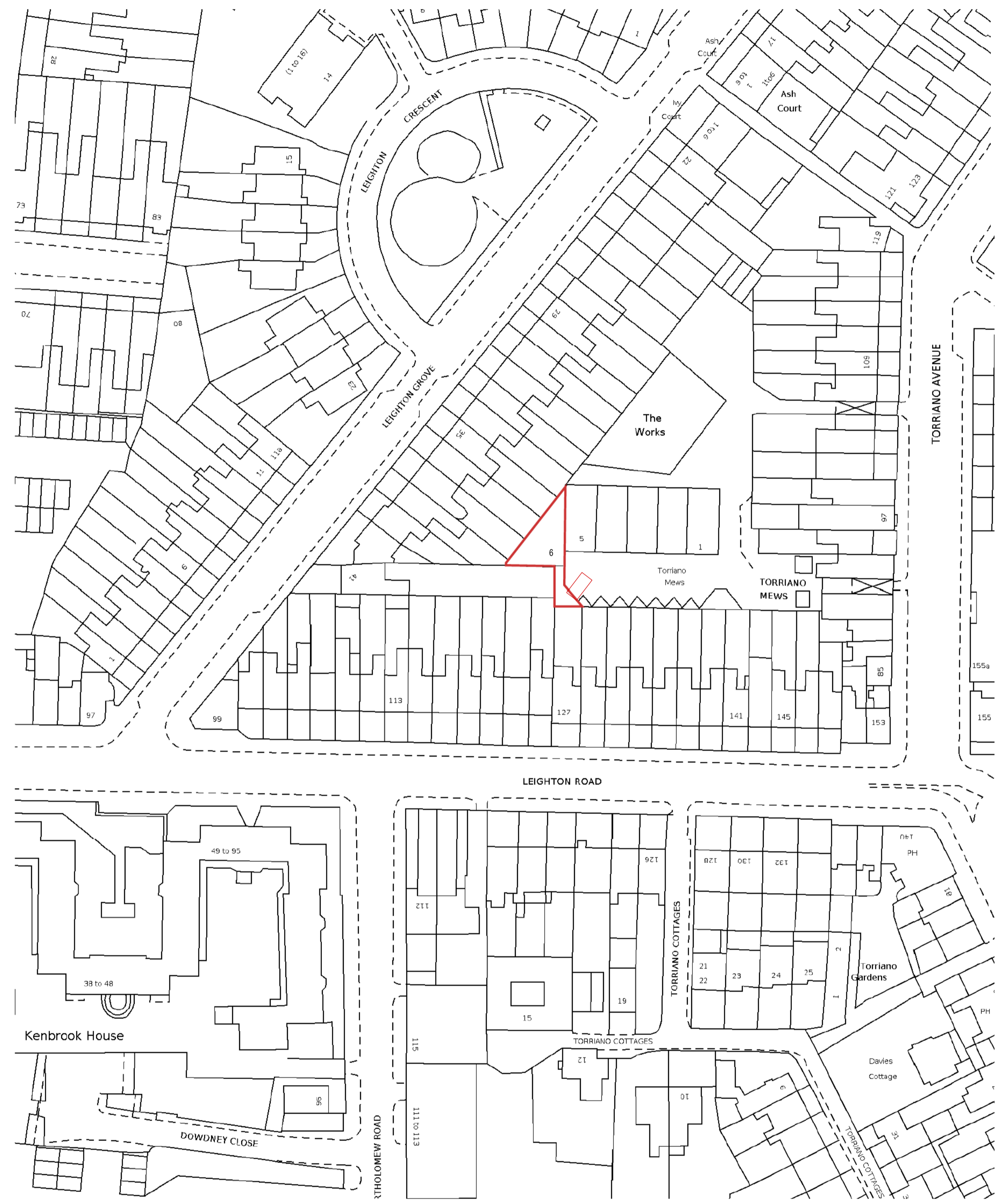
01 LOCATION PLAN 1:1250@A3