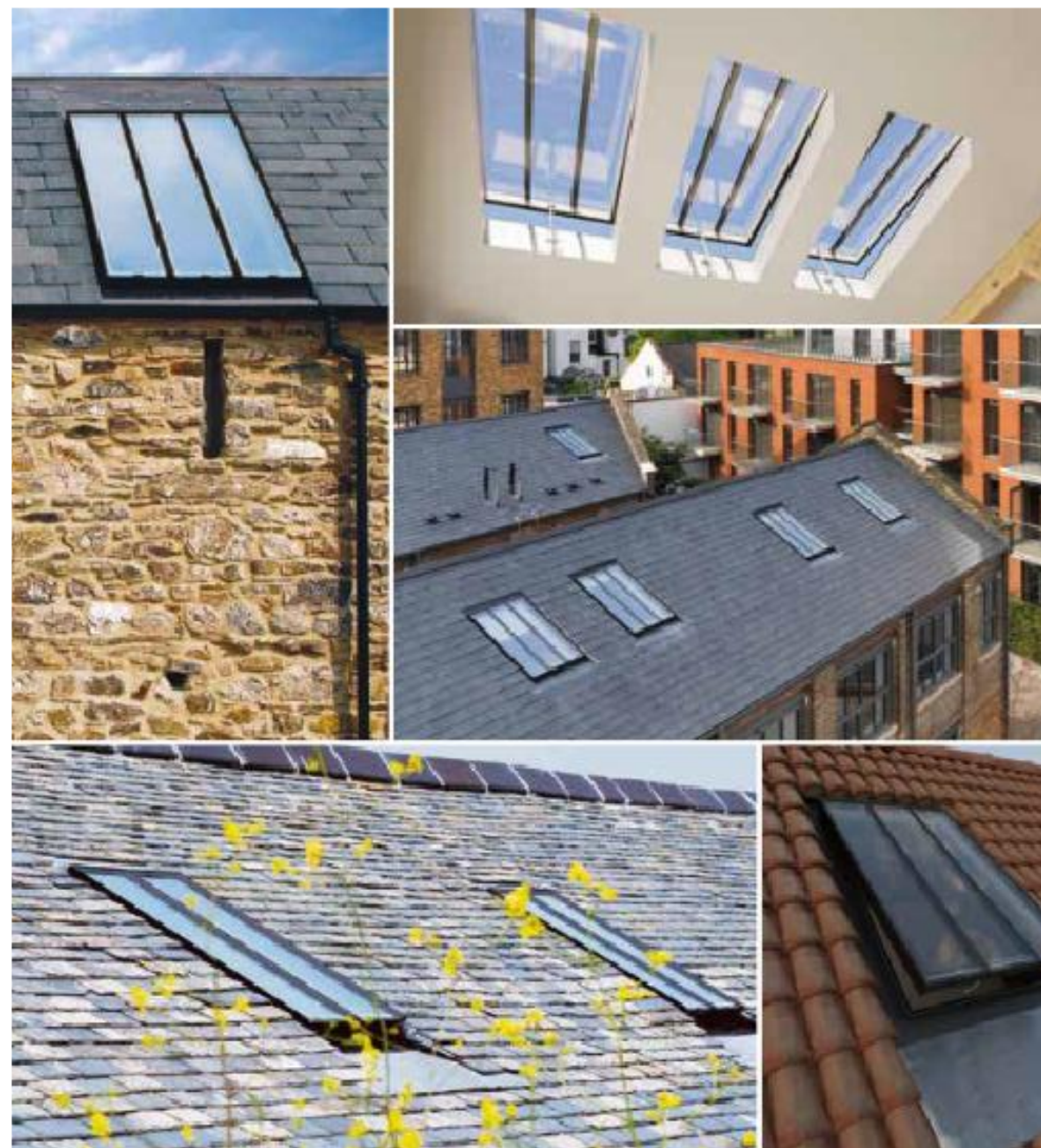
PROPOSED SAMPLE PHOTOS Double Glazed, thermally broken Rooflights Specification: The Conservation Range by The Rooflight Company