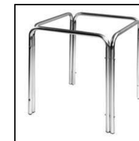
POLISHED ALUMINIUM STACKING BASE