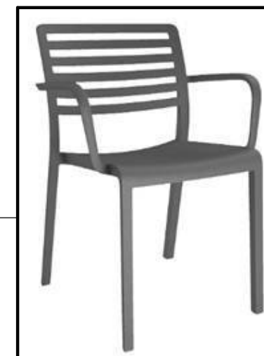
BENTLEY ARM CHAIR