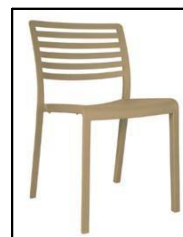
BENTLEY SIDE CHAIR