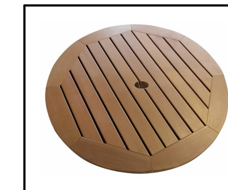
MONACO TABLE TOP