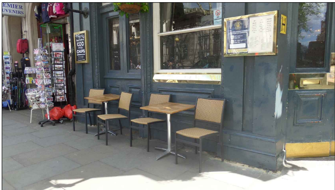
PHOTO A & FURNITURE STYLE