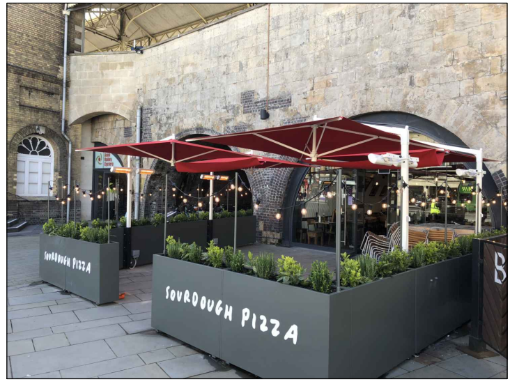
PLANTERS AND JUMBRELLAS - REFERENCE PICTURE