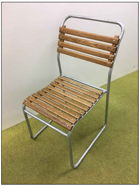
18 no. DINING CHAIRS