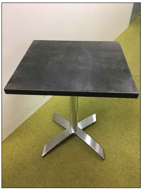
9 no. DINING TABLES 650m600x750mm