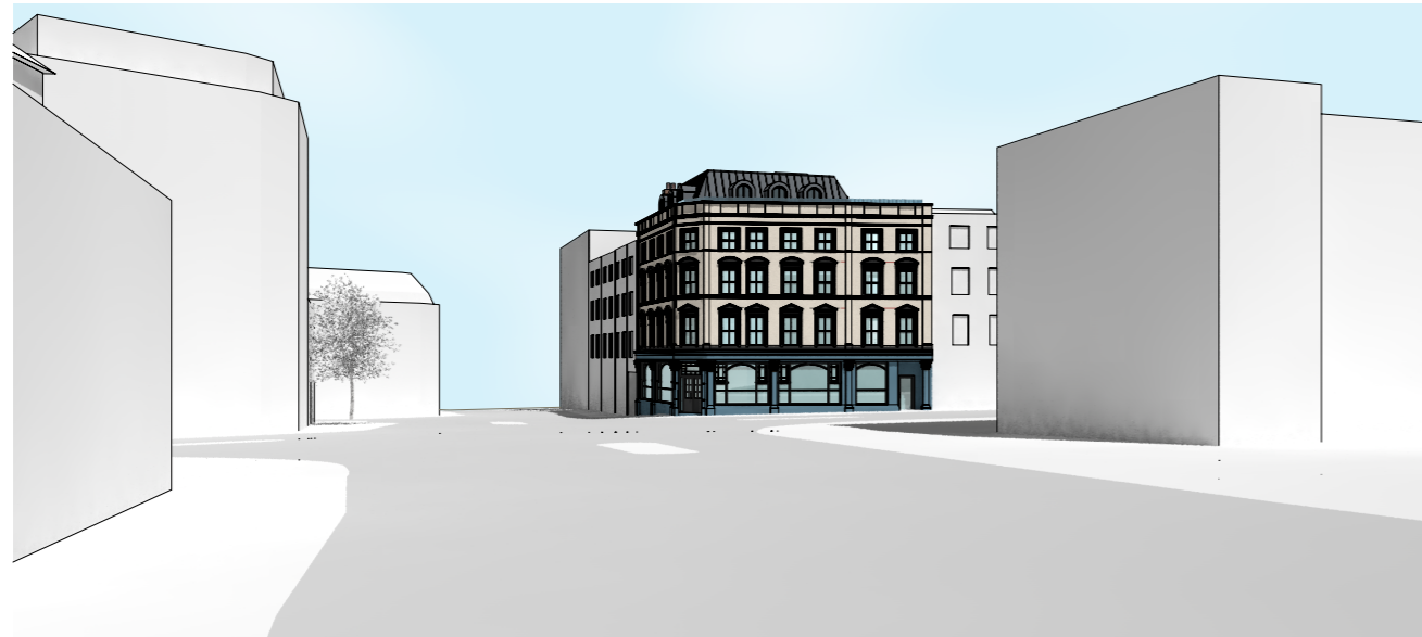
PROPOSED STREET VIEW 5