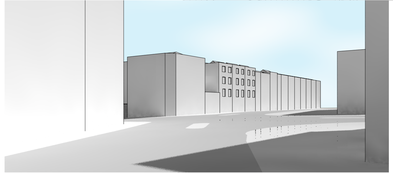
EXISTING STREET VIEW 6