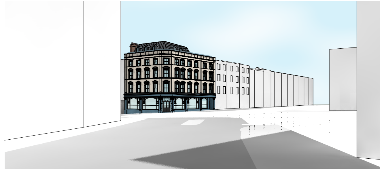
PROPOSED STREET VIEW 6