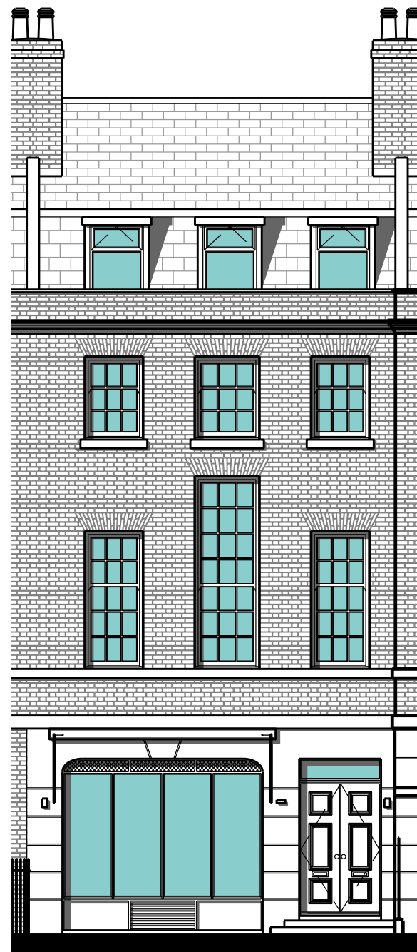
Existing Front Elevation - Percy Street