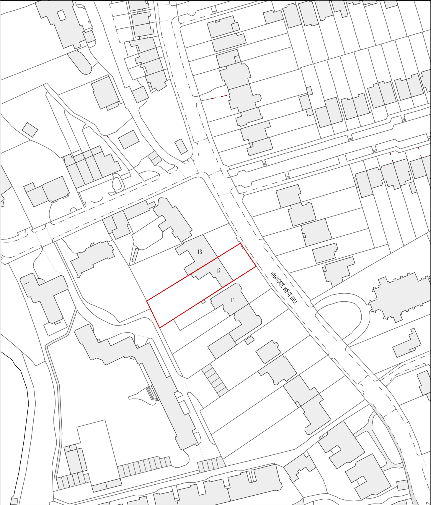
01 - Existing Site Location Plan 1:1250