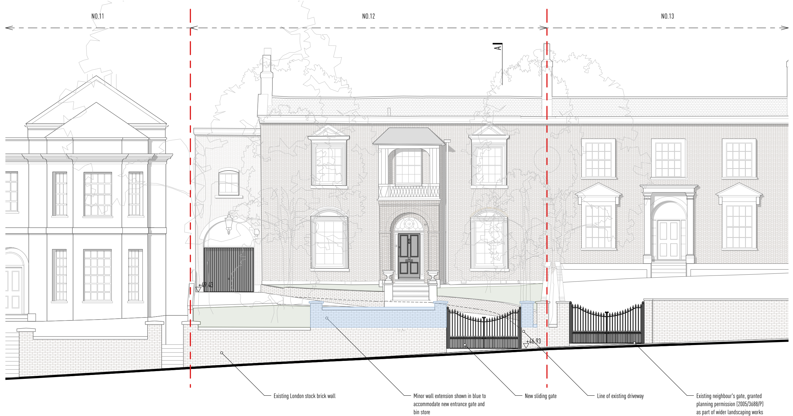
01 - Proposed North-East Elevation Scale 1:100@A3