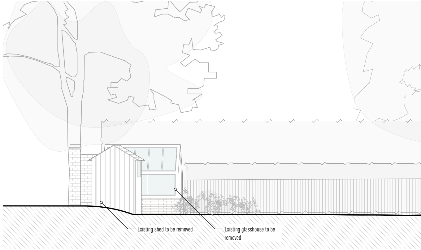
01 - Proposed North-East Elevation Scale 1:100@A3