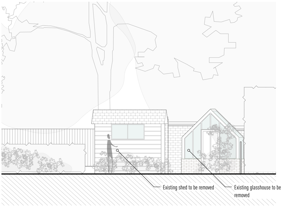
04 - Proposed South-East Elevation Scale 1:100@A3