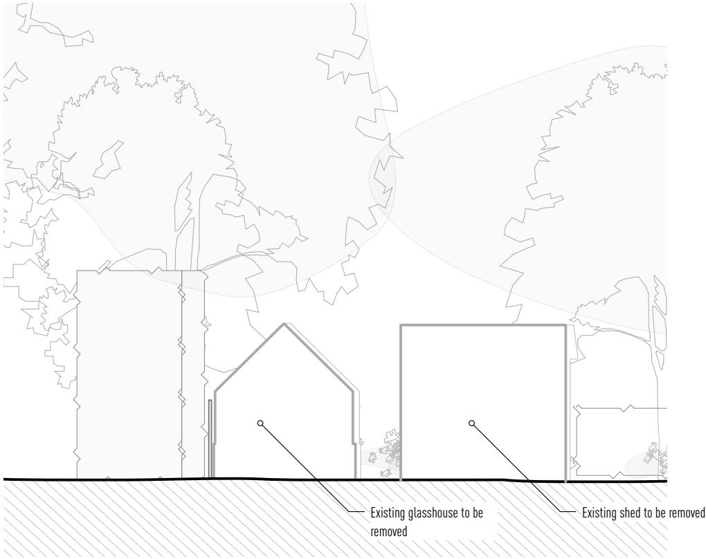
02 - Proposed North-West Elevation Scale 1:100@A3