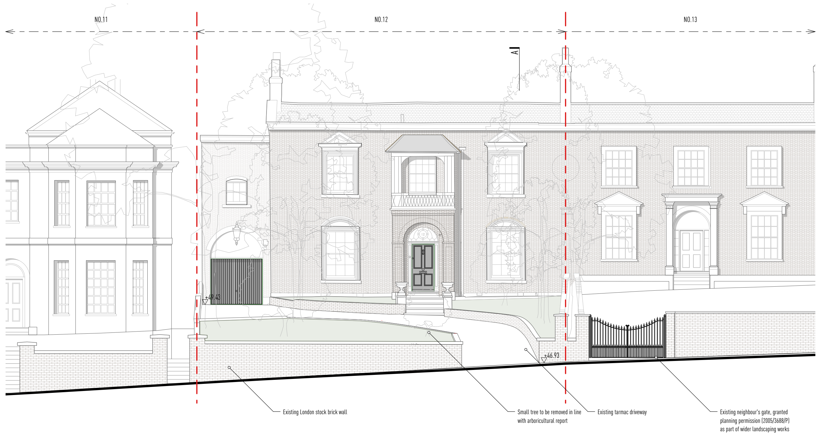
01 - Existing North-East Elevation Scale 1:100@A3