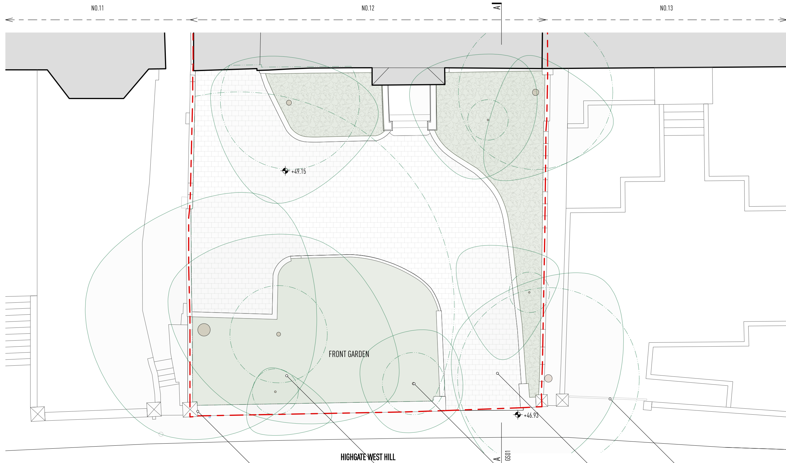
01 - Existing Front Garden Plan Scale 1:100@A3