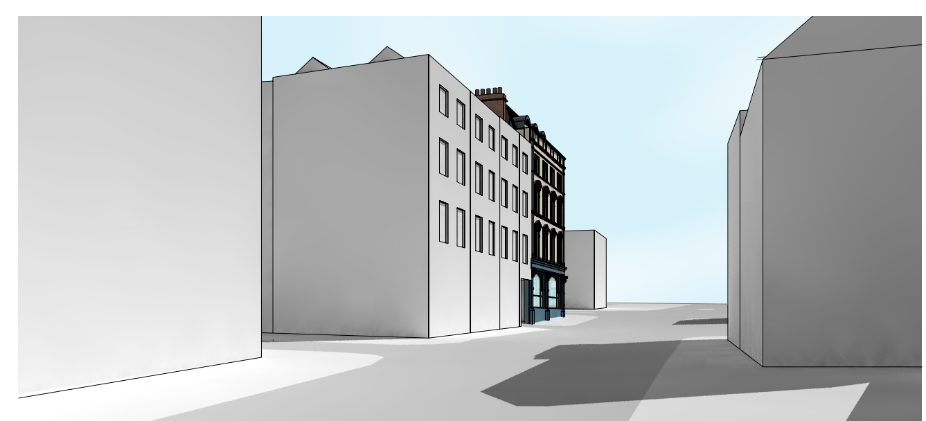
PROPOSED STREET VIEW 7