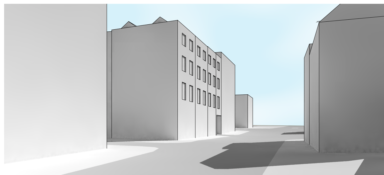
6.08 EXISTING & PROPOSED STREET VIEWS