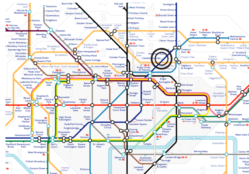
CALEDONIAN ROAD TUBE STATION IS LOCATED IN TFL ZONE 2

According to Transport for London, the overall PTAL of the site, which is a recognised category for the reliability of public transport on a specific site, is 2.