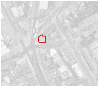
174 Camden High St, London NW1 8NH London Borough of Camden