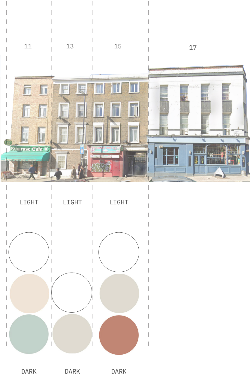
YORK WAY STREET ELEVATION