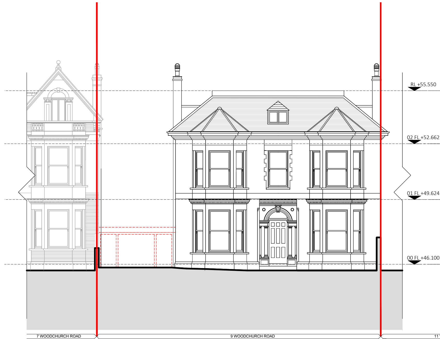
1 EXISTING FRONT DEMO ELEVATION 1:100 @ A3