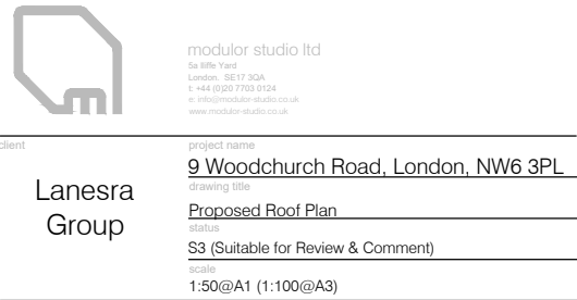
1 PROPOSED ROOF PLAN 1:100 @ A3