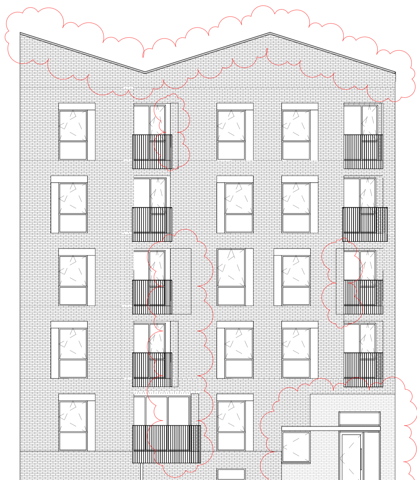
2 | Plot 5 - Elevation 06 1:100