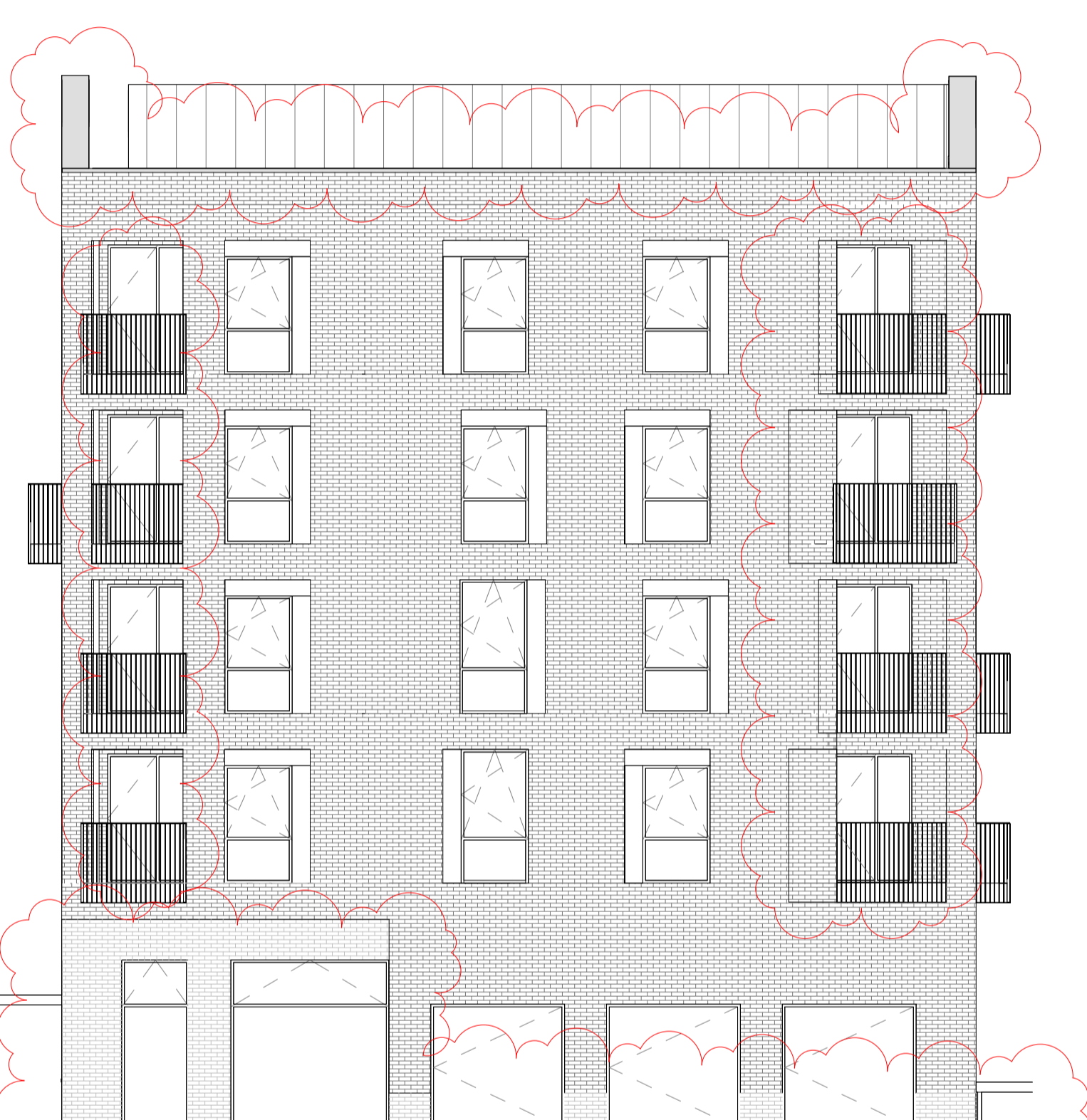
3 | Plot 5 - Elevation 07 1:100