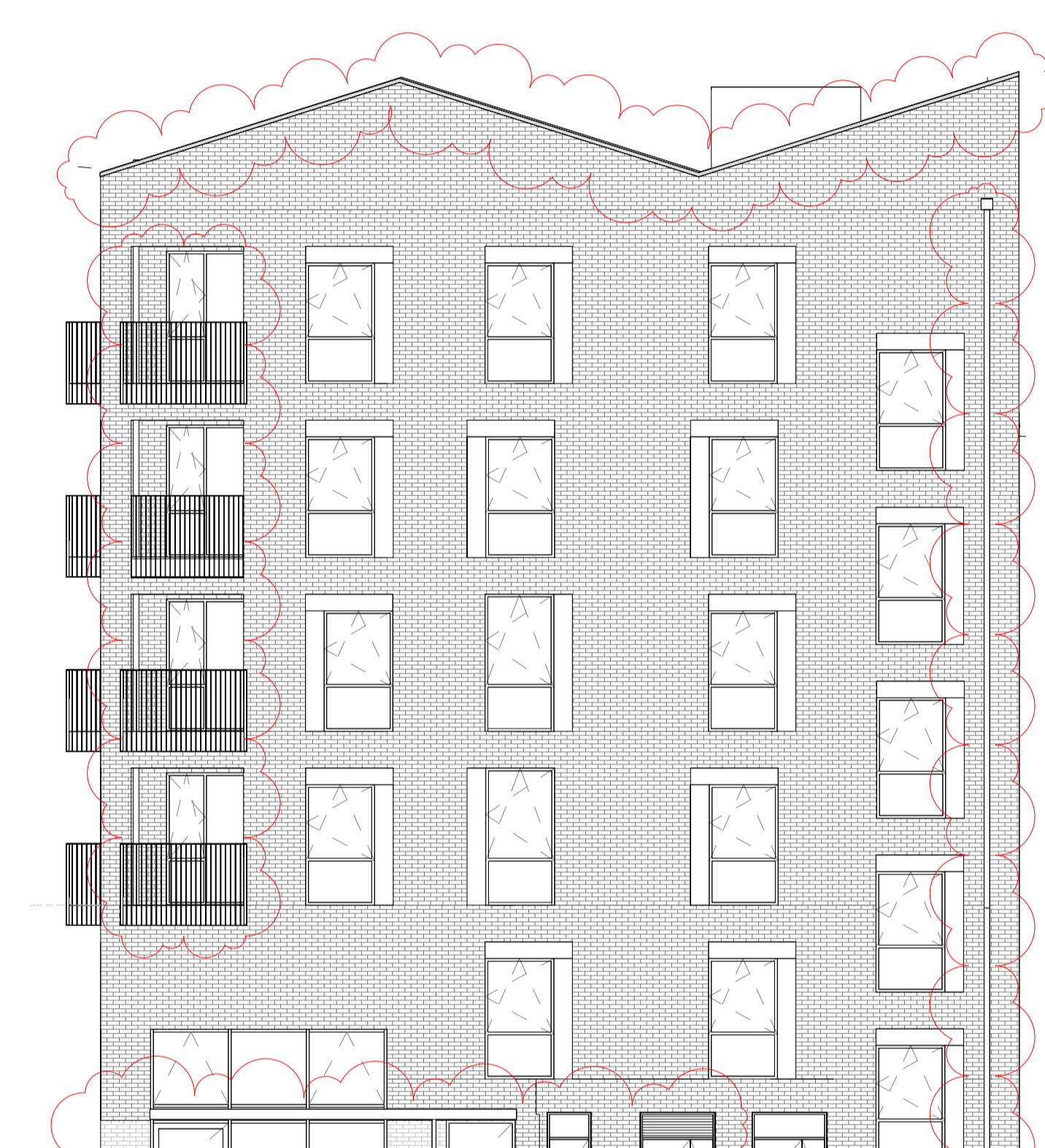
4 | Plot 5 - Elevation 08 1:100

Notes 1. Do not scale this drawing. 2. All dimensions must be checked on site and any discrepancies verified with the architect. 3. Unless shown otherwise, all dimensions are to structural surfaces. 4. Drawing to be read with all other issued information. Any discrepancies to be brought to the attention of the architect. 5. This drawing is the copyright of Levitt Bernstein and may not be copied, altered or reproduced in any form, or passed to a third party without license or written consent. 6. This document is prepared for the sole use of London Borough of Camden and no liability to any other persons is accepted by Levitt Bernstein. Levitt Bernstein accepts no liability for use of this drawing by parties other than the party for whom it was prepared or for purposes other than those for which it was prepared. This is not a construction drawing, it is unsuitable for the purpose of construction and must on no account be used as such.