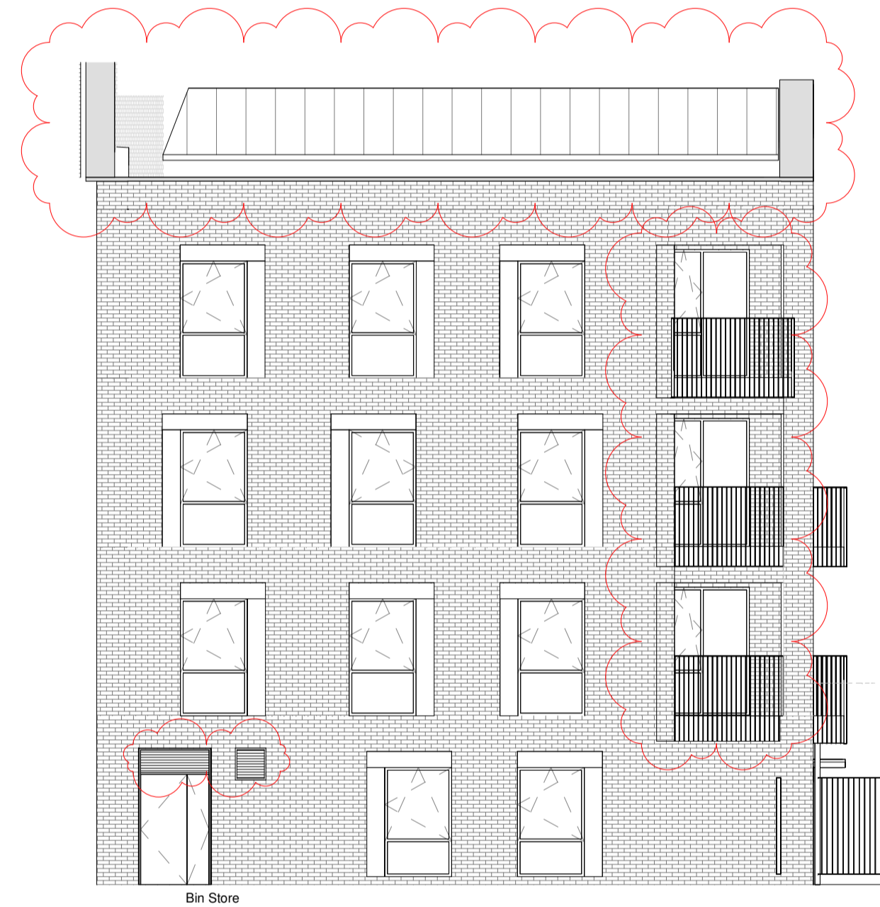
2 | Plot 5 - Elevation 02 1:100