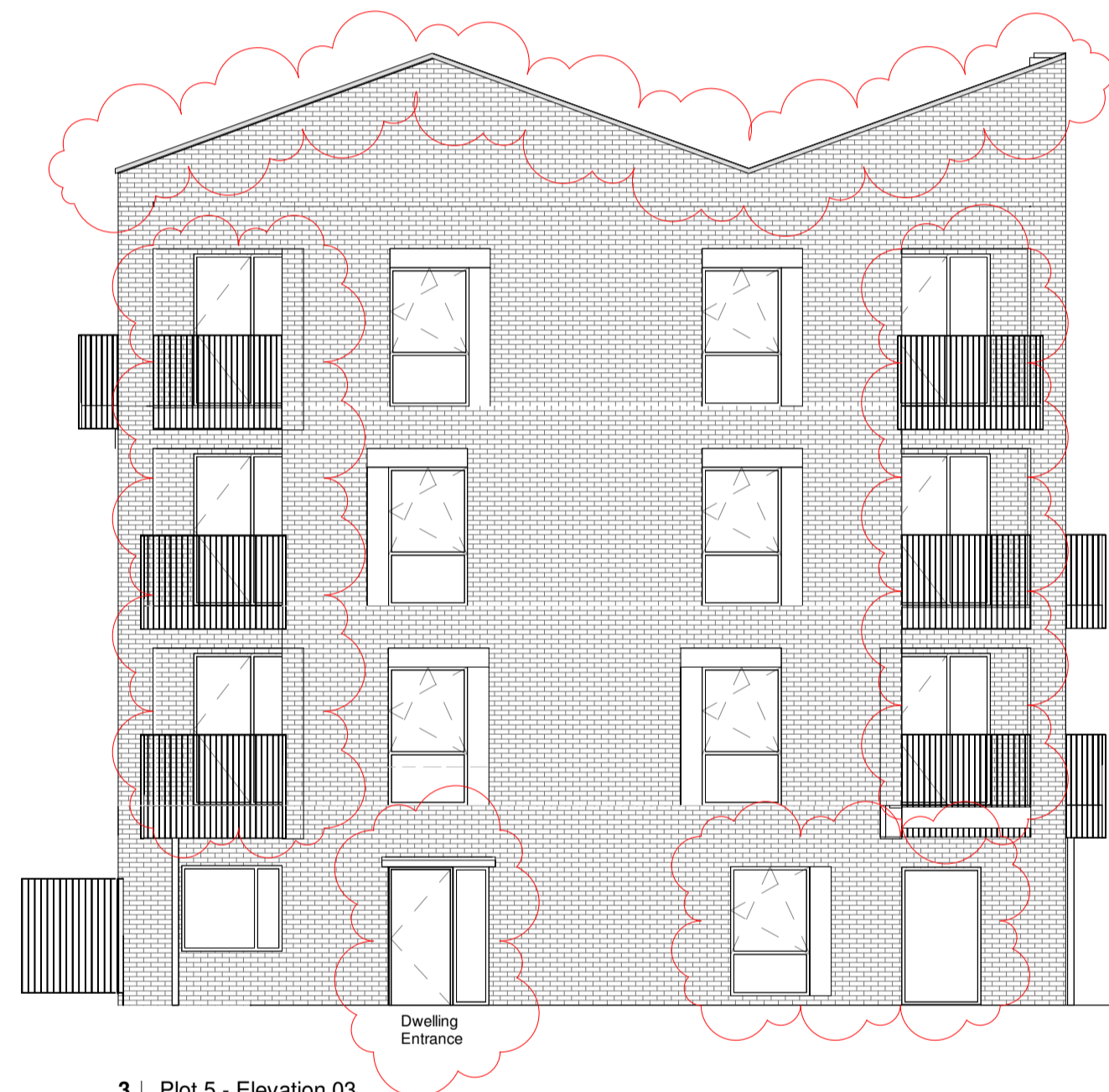
3 | Plot 5 - Elevation 03 1:100