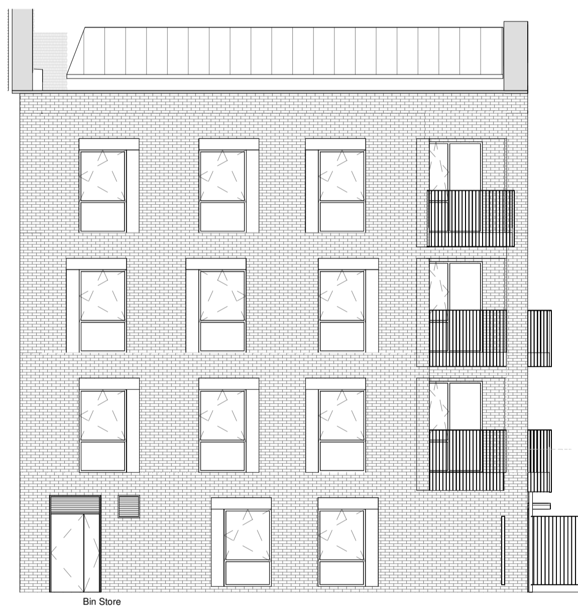
2 | Plot 5 - Elevation 02 1:100