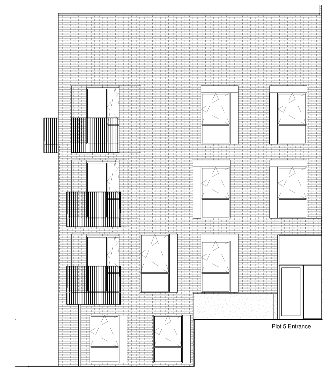
4 | Plot 5 - Elevation 04 1:100