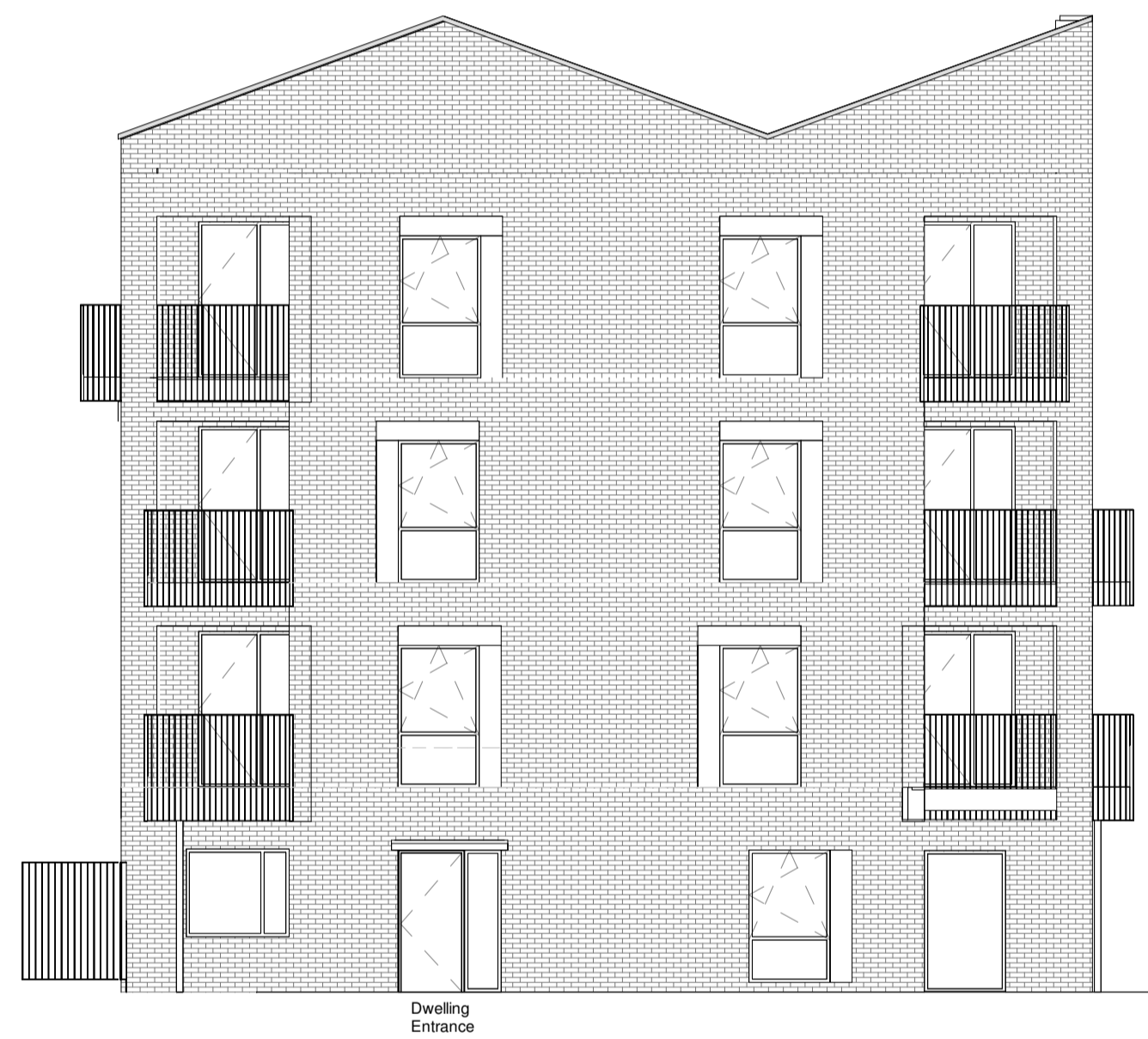
3 | Plot 5 - Elevation 03 1:100