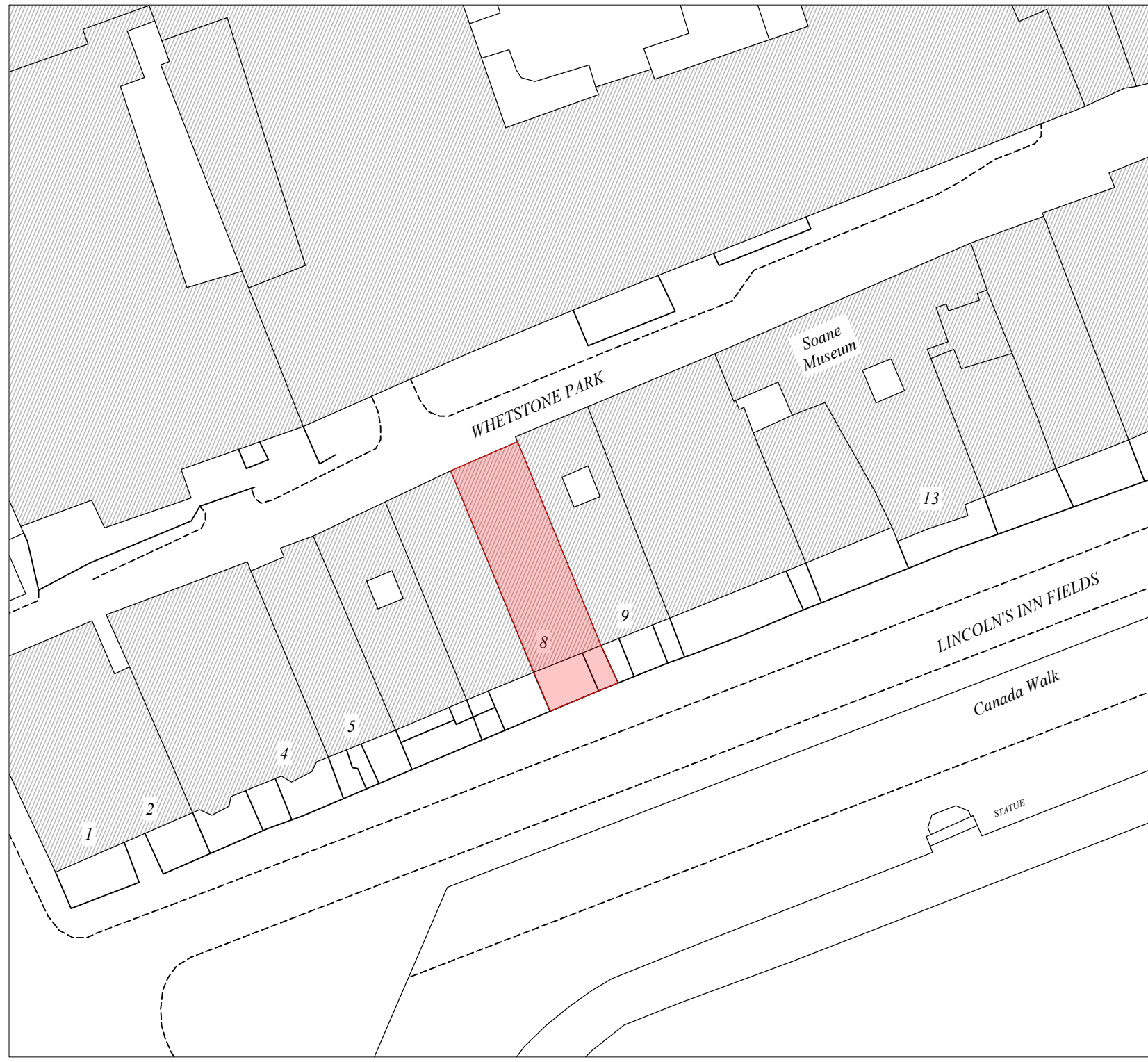
BLOCK PLAN 1:500 @ A3

Notes: This drawing is the copyright of Giles Quarme Architects and cannot be printed or reproduced without prior permission. This drawing has been based on survey information provided by others. All dimensions and setting out must be verified on site before commencement of the work, and any discrepancies notified to the architect. All windows and doors are to fit into existing openings unless stated otherwise. All dimensions are in millimetres unless stated otherwise.