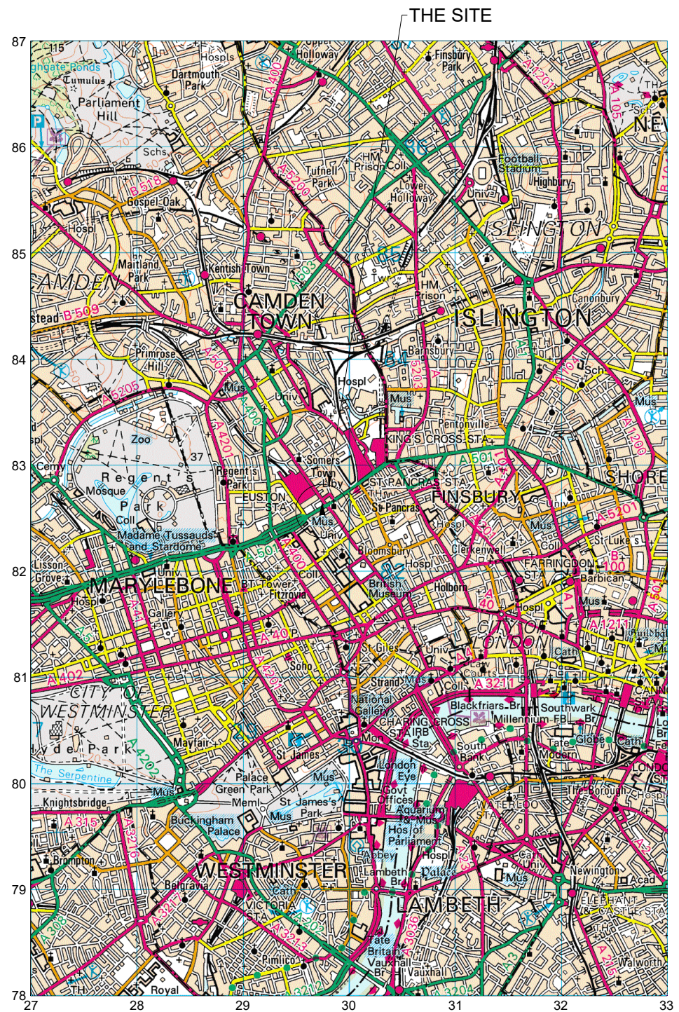
LOCATION PLAN SCALE 1:50,000