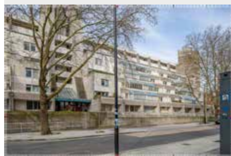
Brunswick Centre - Existing 7147_1801 version 230511