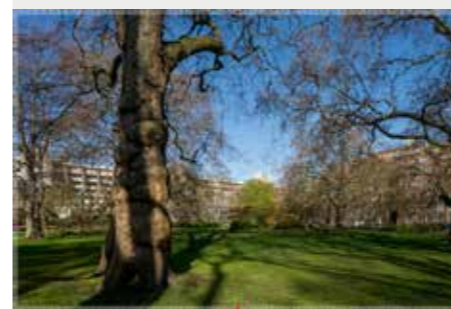
Brunswick Square Gardens SW - Existing 7147_1901 version 230511