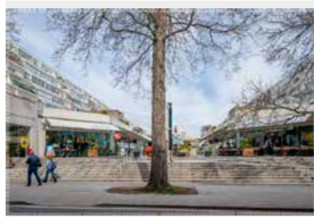
Russell Street - Existing 7147_1301 version 230511

An accurate visual representation of key views toward the proposed condensers location has been carried out. The following images are showing a very low impact on the historic profile of the building. An assessment of the views has been provided in the supporting Heritage Assessment, prepared by Purcell.