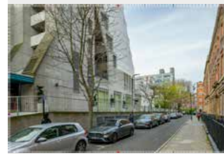
Handel Street - Existing 7147_1701 version 230511