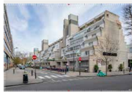
Russell Square Station - Existing 7147_1401 version 230511