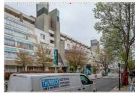
Marchmont Street - Proposed 7147_1605 version 230522