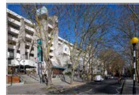
Landscaped area at the junction - Existing 7147_2201 version 230511