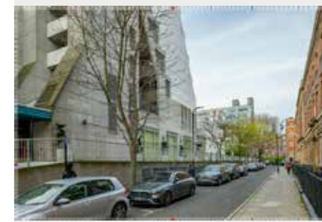
Handel Street - Proposed 7147_1705 version 230511