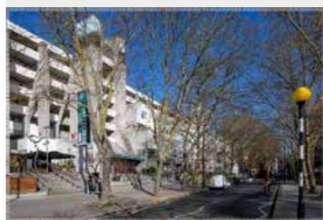
Landscaped area at the junction - Proposed 7147_2205 version 230511