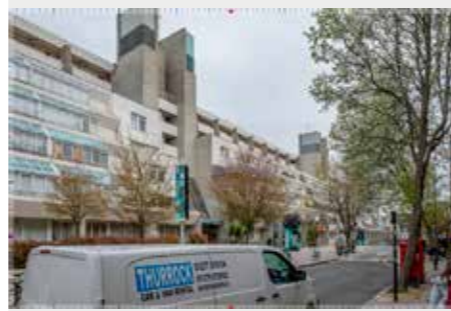
Marchmont Street - Existing 7147_1601 version 230511