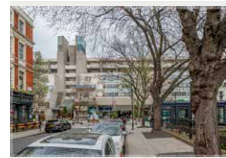
Marchmont Street East - Existing 7147_1501 version 230511