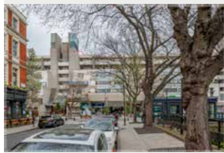
Marchmont Street East - Proposed 7147_1505 version 230511