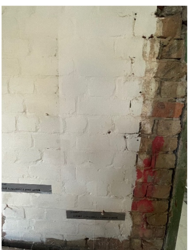
No 3: One-part Pozzolan Limewash onepart water plus two coats exterior limewash