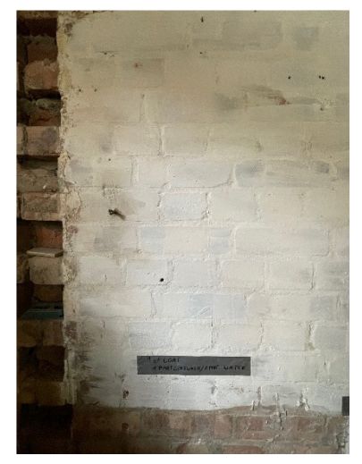
No 1: One-part Pozzolan Limewash one-part water.