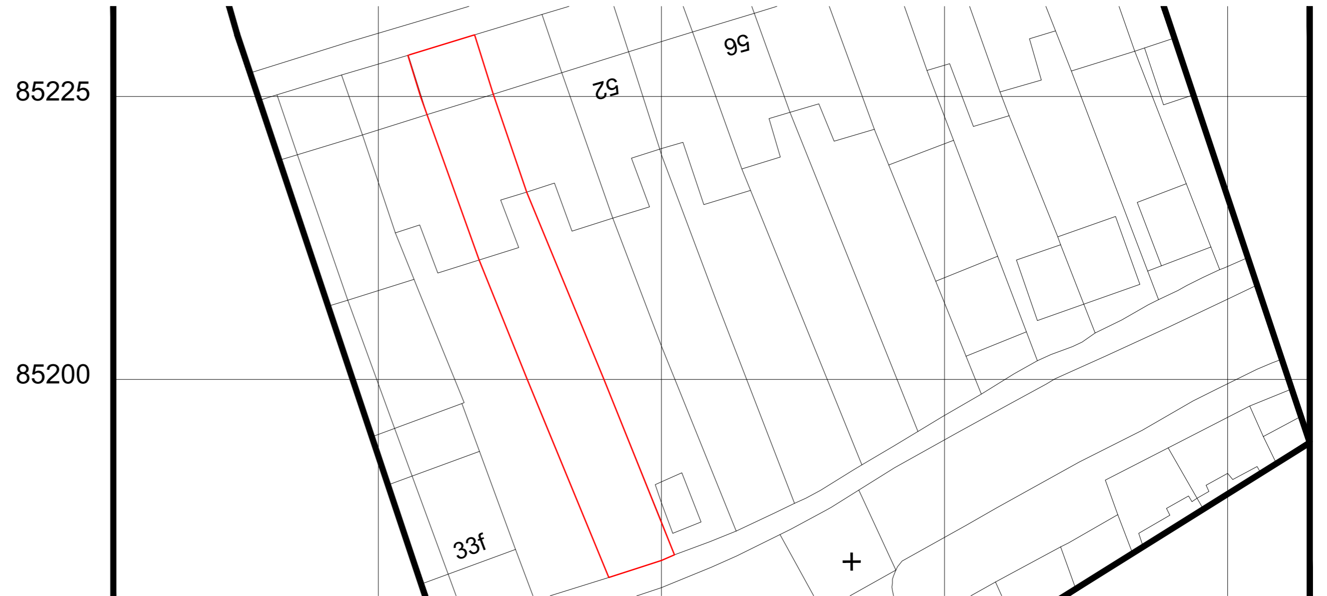
SITE BLOCK PLAN 1:500