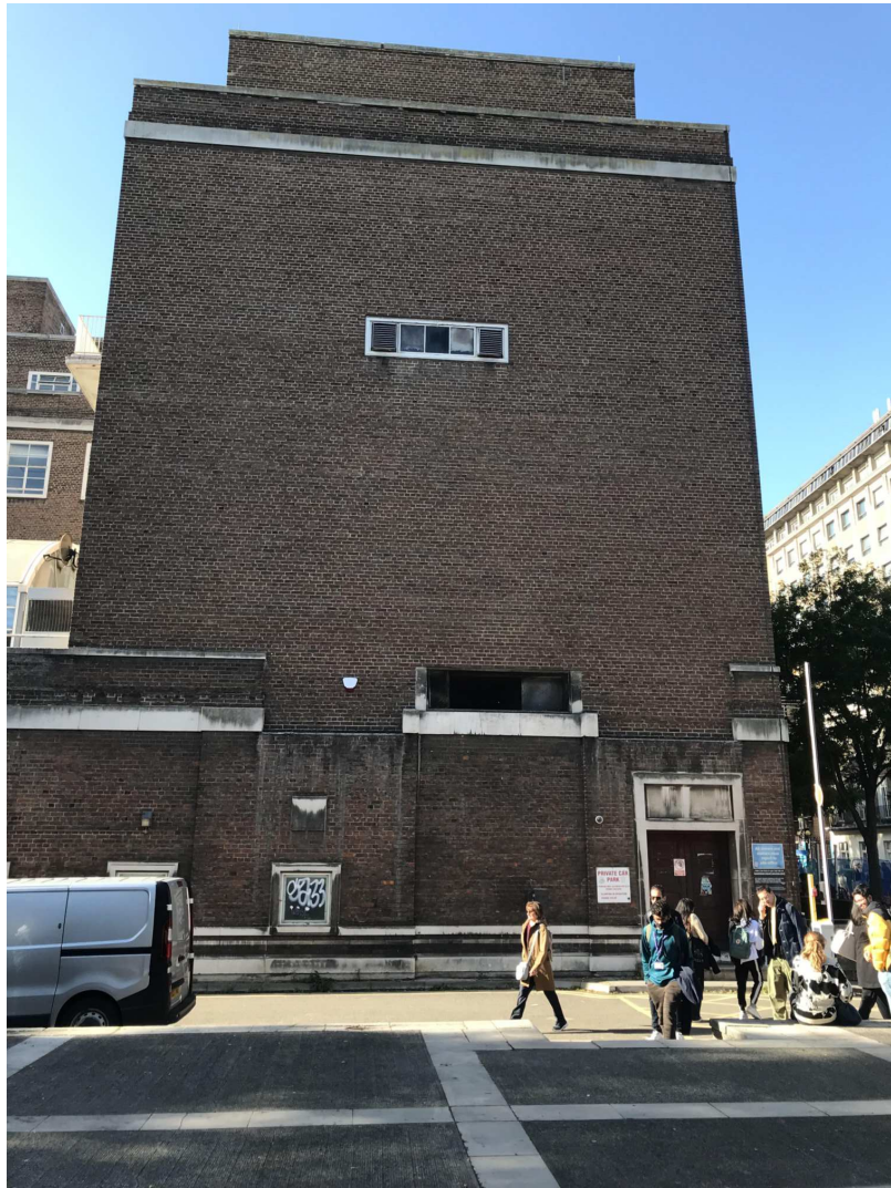
PHOTO OF EXISTING GRILLE OVERLOOKING TORRINGTON SQUARE