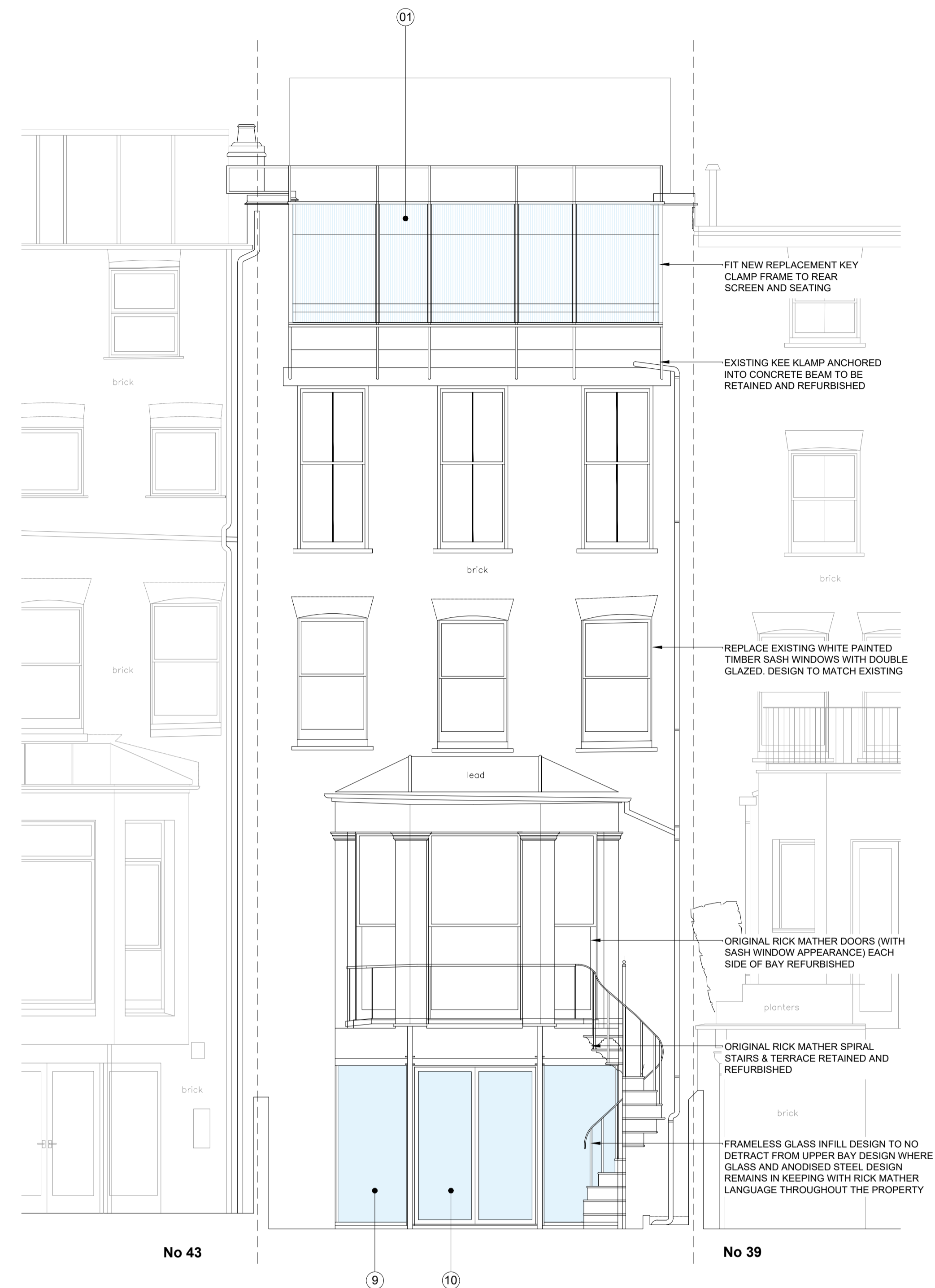
SW SOUTH WEST (REAR) ELEVATION SCALE 1:50 @ A1 & 1:100@A3

Disclaimer: This drawing is the exclusive property of AUA Ltd. The reproduction in whole or in part is prohibited without prior written consent of AUA Ltd. The contractor is to check and verify all levels, datum and dimensions and report any discrepancies to AUA Ltd prior to construction. Drawings are not to be scaled. AUA Ltd is not responsible for any dimensions of the site plan unless they are taken directly from a registered survey carried out by a licensed land surveyor. This drawing is to be read in conjunction with structural, mechanical, electrical and or other consultant's documentation that is applicable to the project.