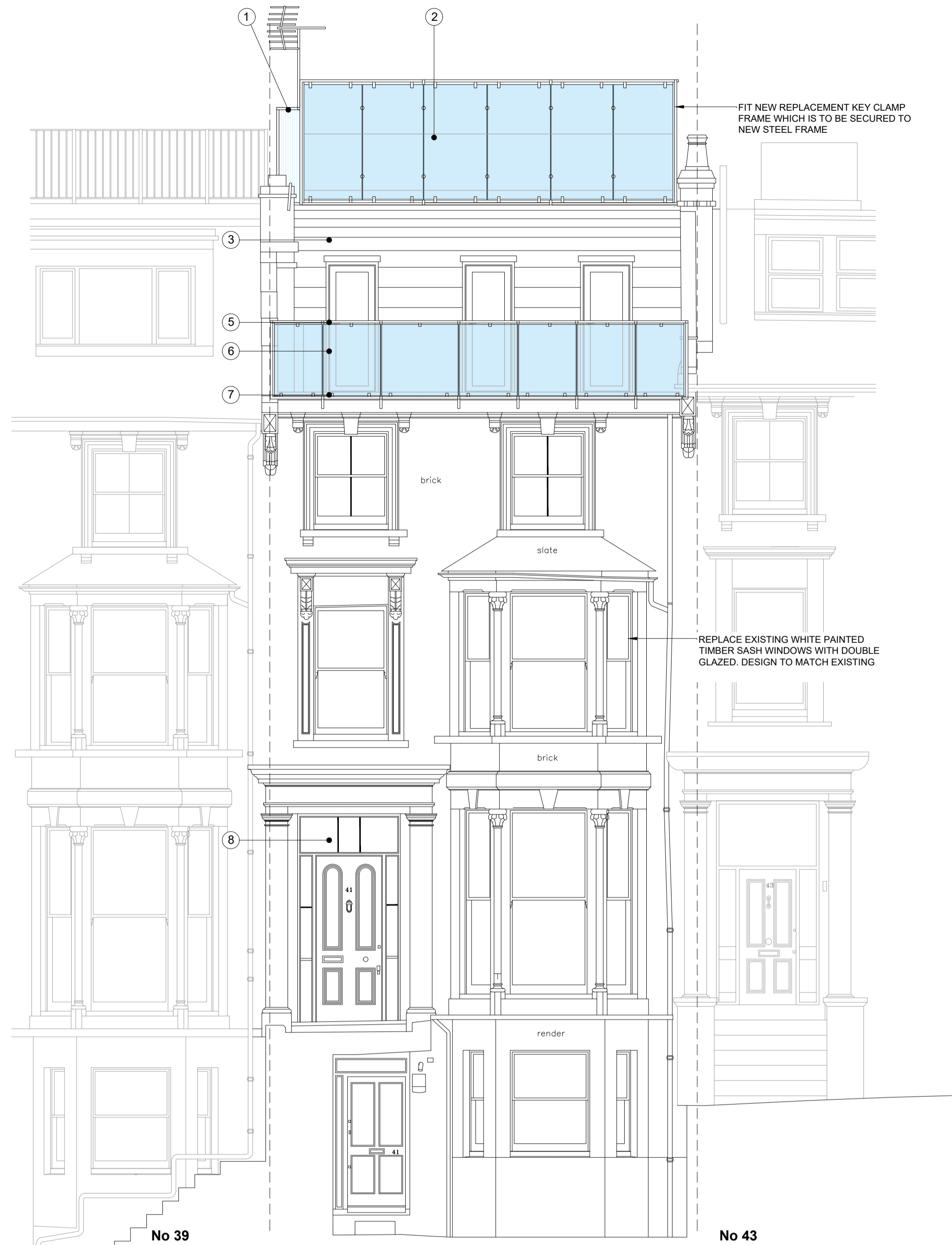
NE NORTH EAST (FRONT) ELEVATION SCALE 1:50 @ A1 & 1:100@A3