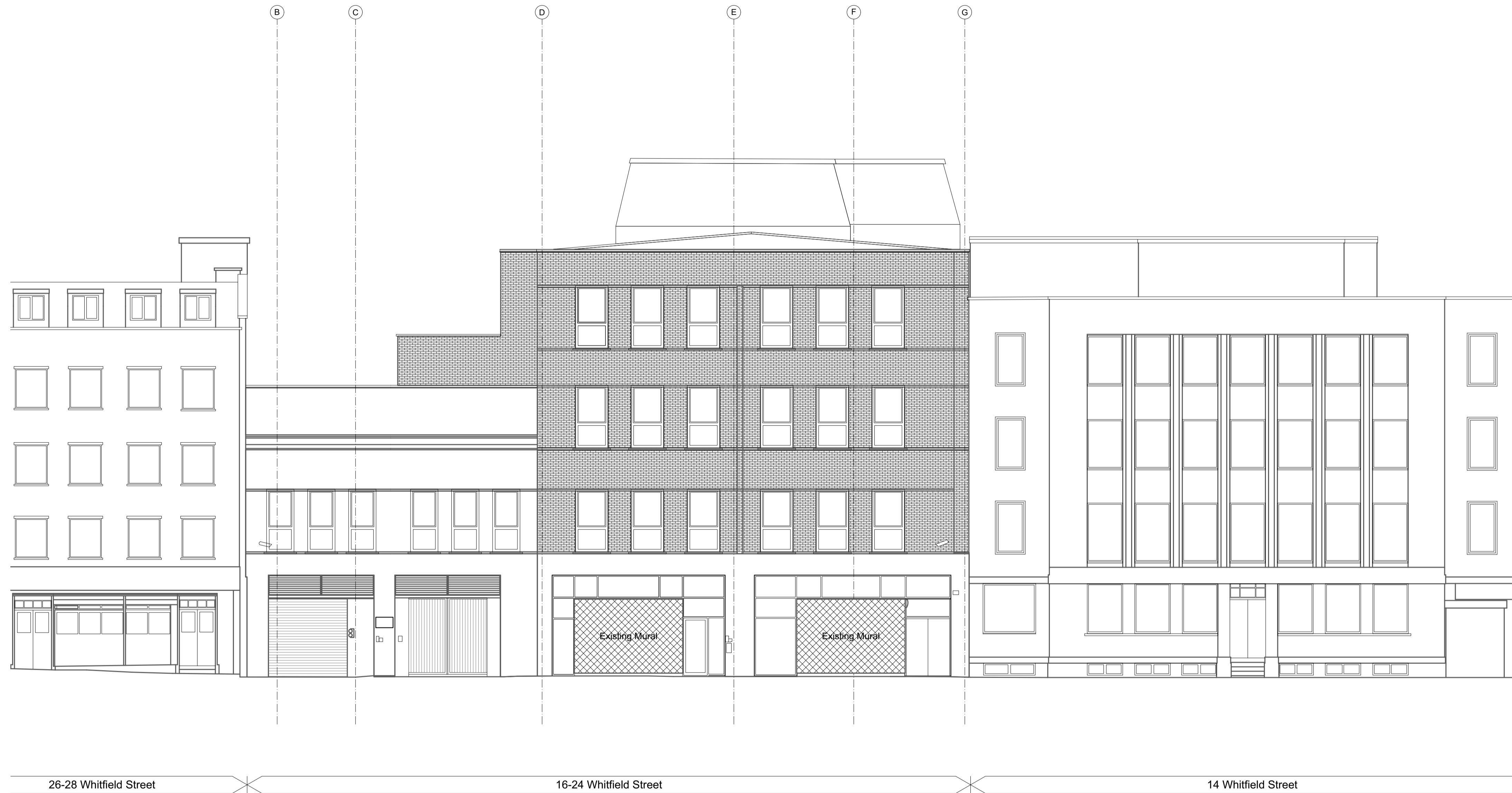
1 Existing West (Whitfield Street) elevation Scale: 1:100