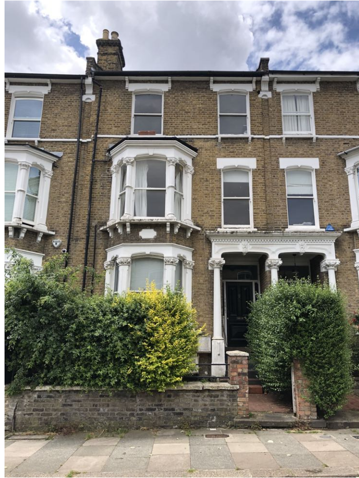
FRONT VIEW OF 23 BOSCASTLE ROAD