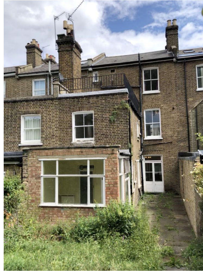
REAR VIEW OF 23 BOSCASTLE ROAD