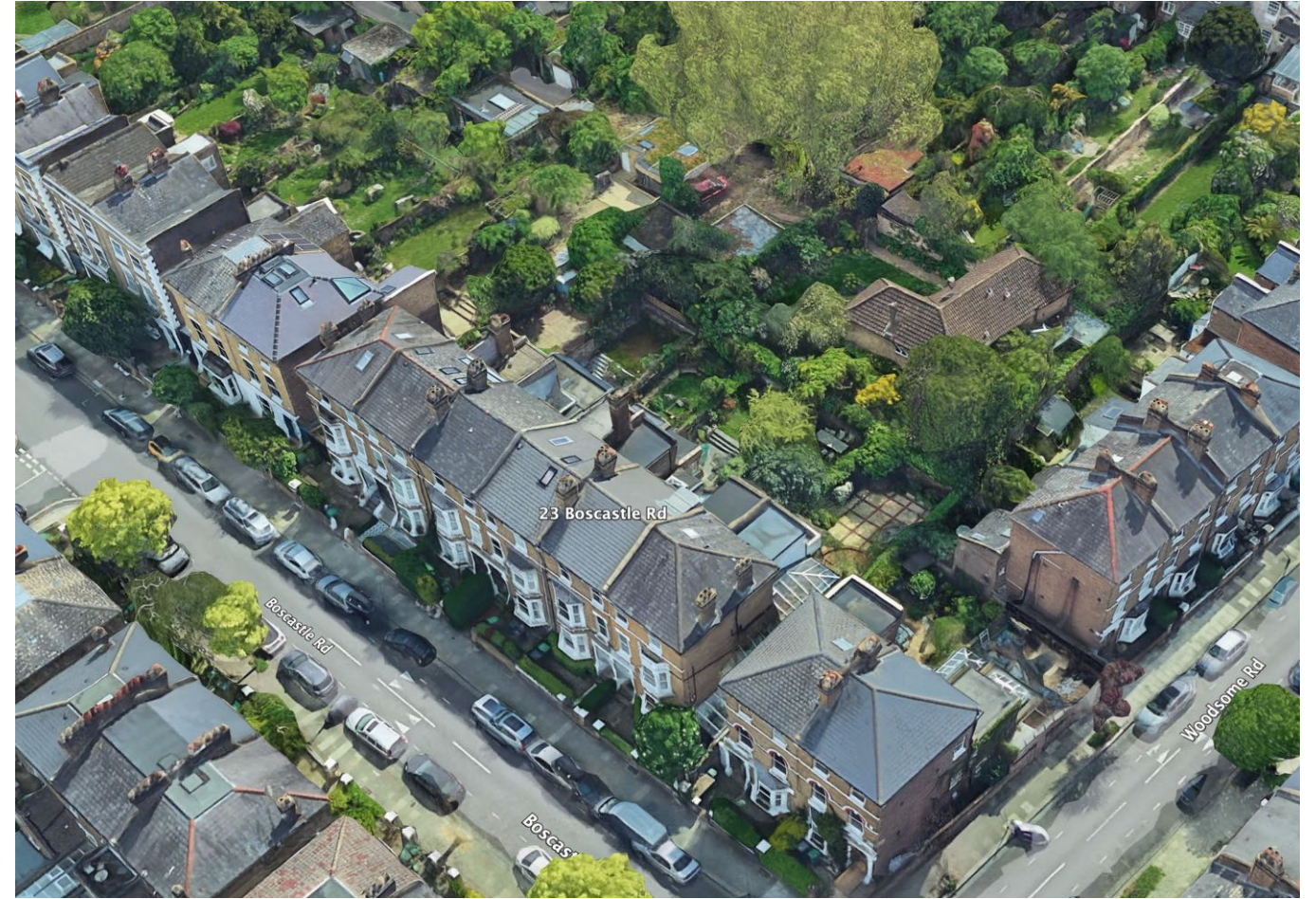
AERIAL VIEW OF 23 BOSCASTLE ROAD