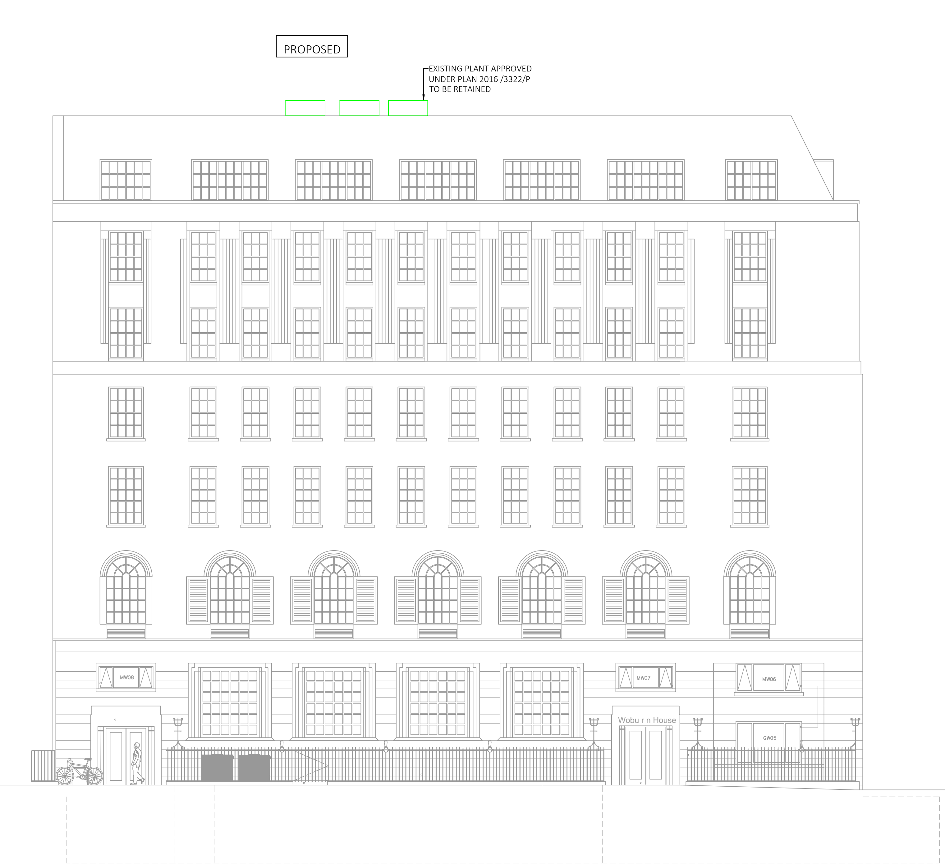
Tavistock Square Elevation