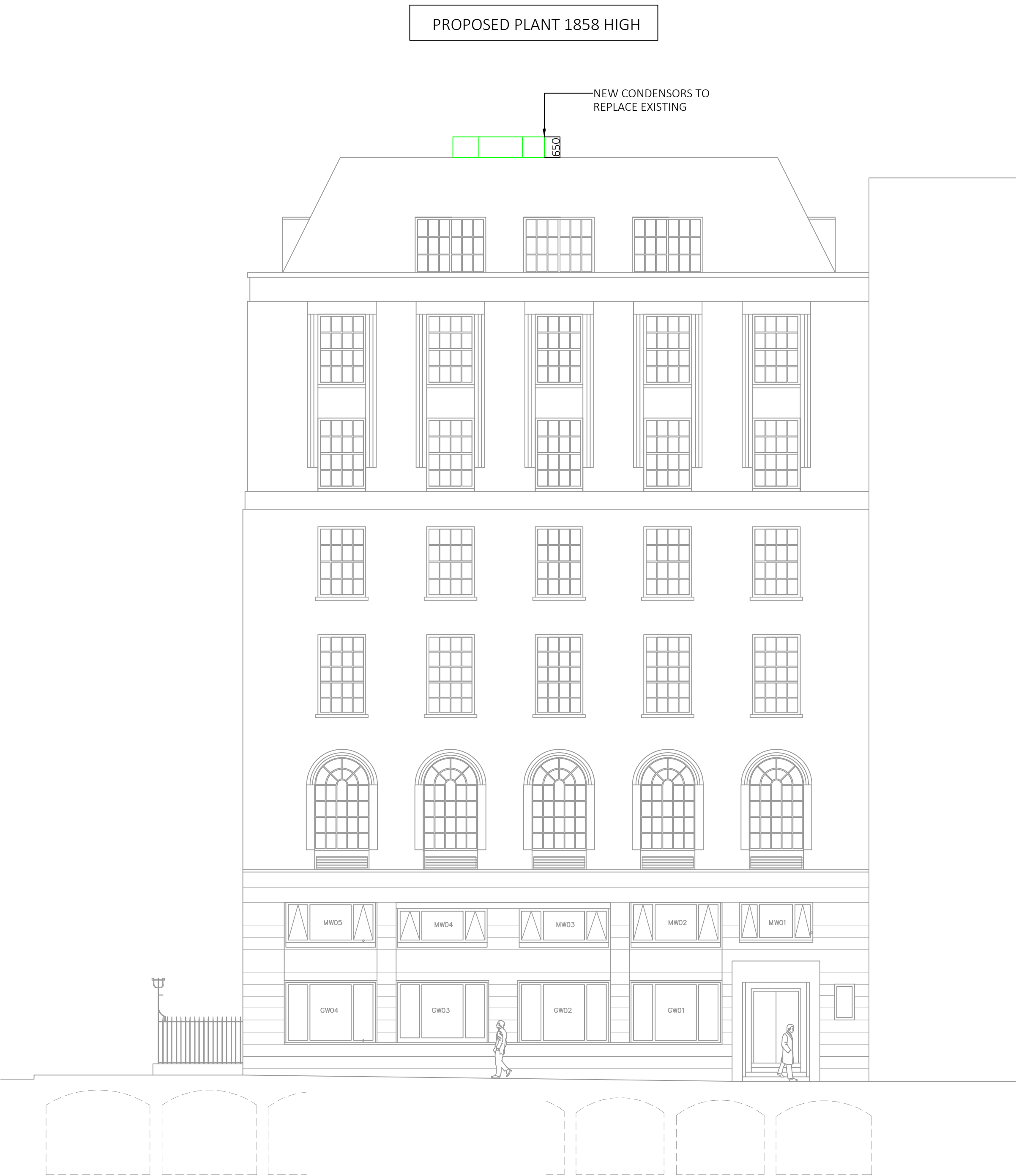
Upper Woburn Place Elevation