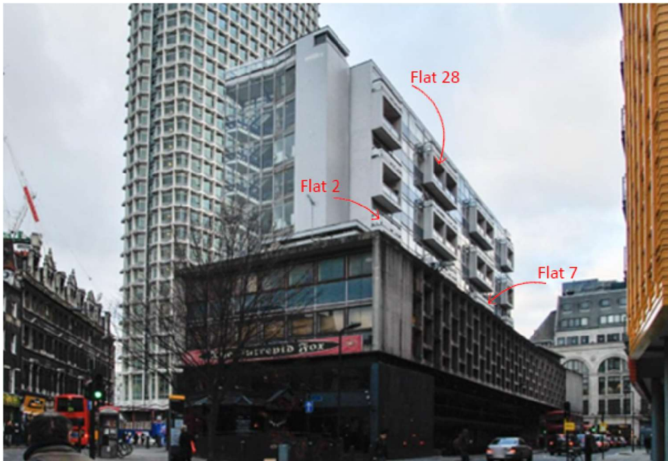
Centre Point House, view looking towards Centre Point. (Flats 2, 7 & 28 located on the east elevation)

Design & Access Statement, cph_das_27828_000