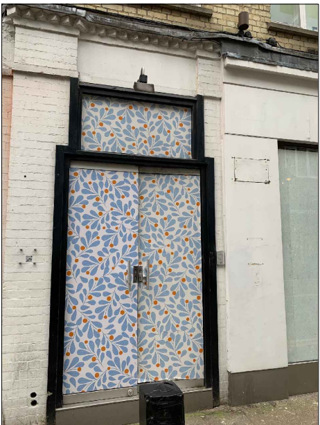
57-59 Neal Street Shopfront Elevation - Office entrance