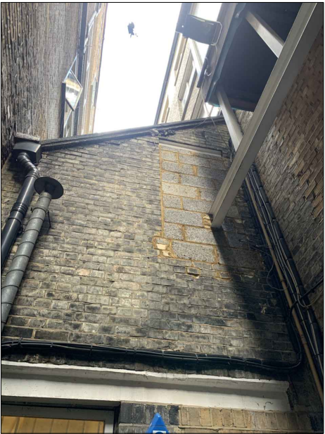
View at bottom of lightwell looking up to ground and first floor extension.