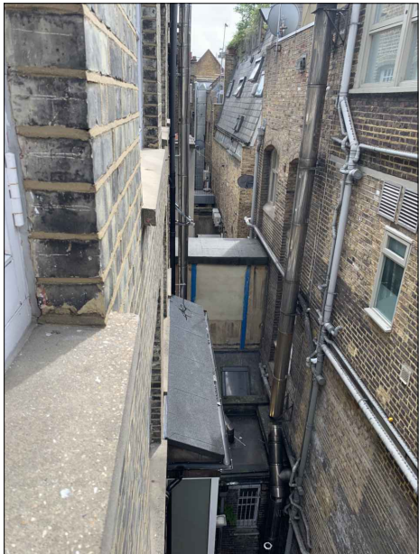
View from 57-59 Neal Street looking into lightwell and across to neighbours rear elevations