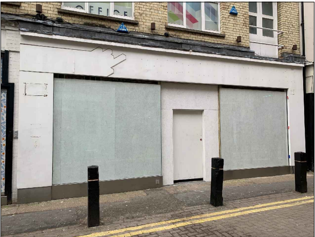
57-59 Neal Street Shopfront Elevation - Retail entrance