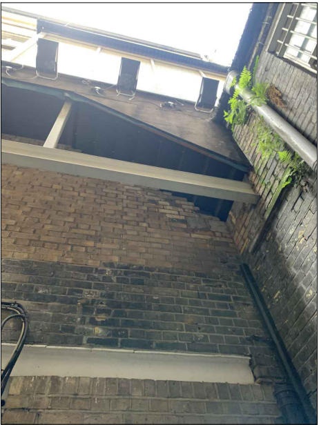
View at bottom of lightwell looking up to rear 57-59 extension.