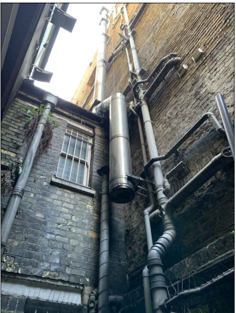
View at bottom of lightwell looking up to the rear ground floor extension