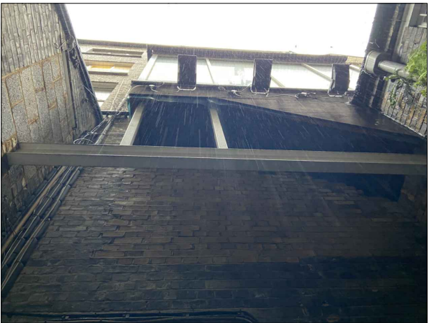
View looking up to existing rear staircase extension