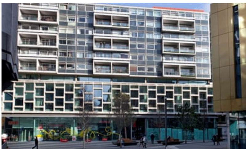
Centre Point House, West Elevation, view from below Centre Point.