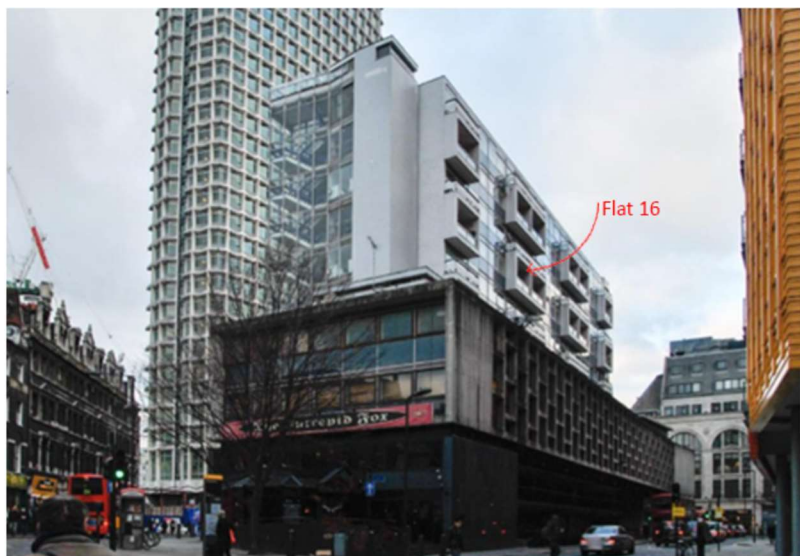
Centre Point House, view looking towards Centre Point. (Flat 16 located on the east elevation)

Design & Access Statement cph_das_16_000