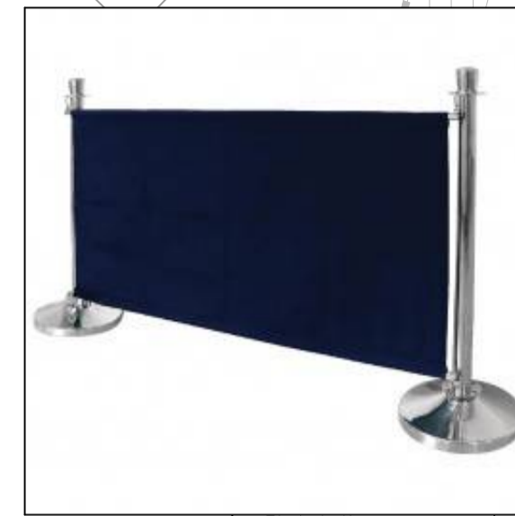
SEATING TO REAR AND BARRIERS