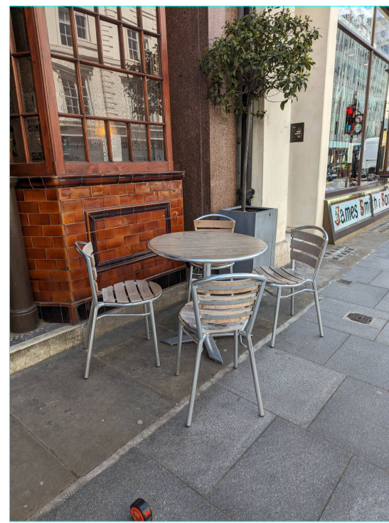
SEATING TO FRONT