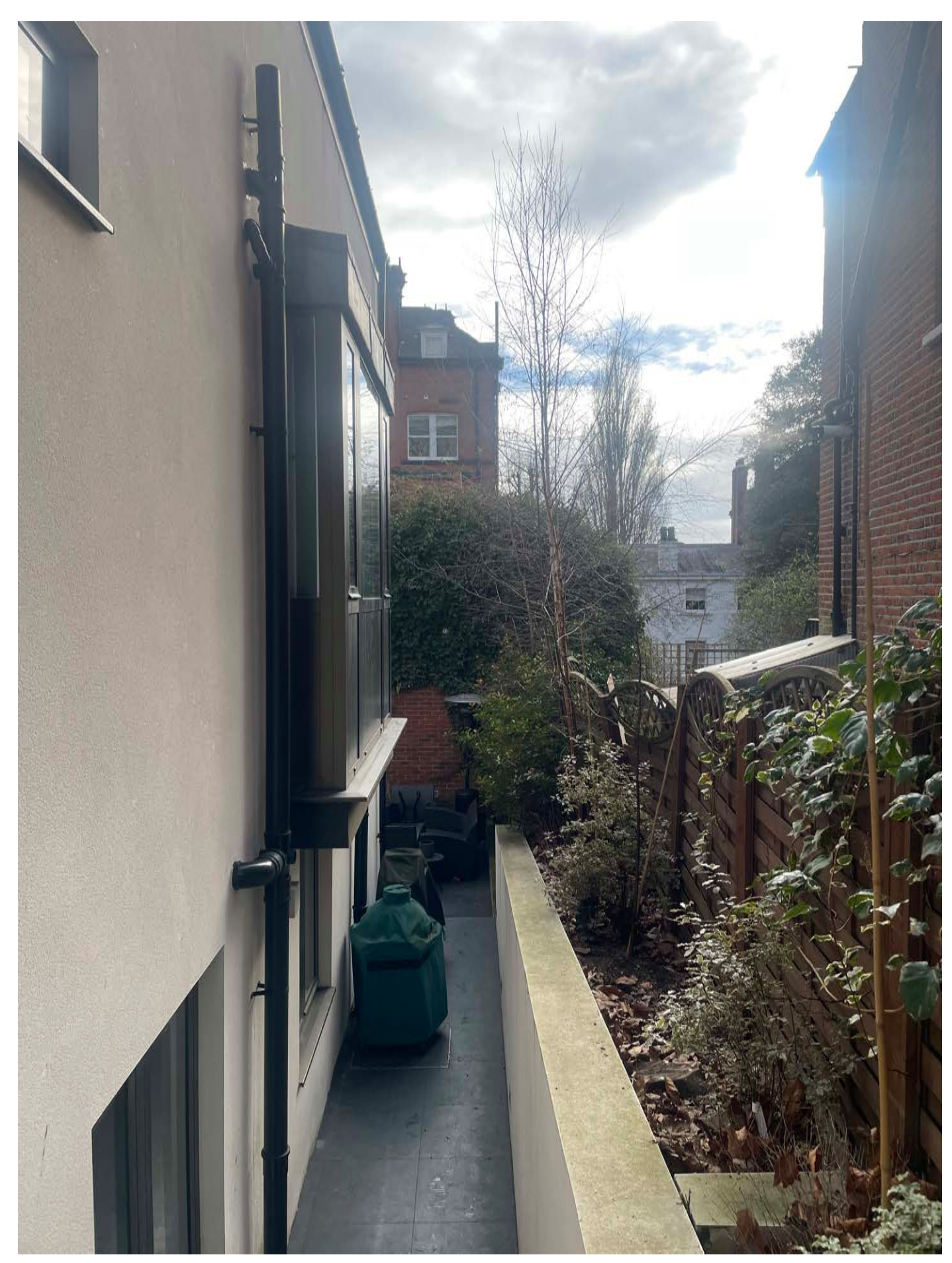
\label{thm:continuous} The \ {\tt Existing Fence} \ is \ {\tt rotting} \ and \ has \ {\tt collapsed}. \ It \ has \ been \ temporarily \ propped \ to \ keep \ it \ upright.