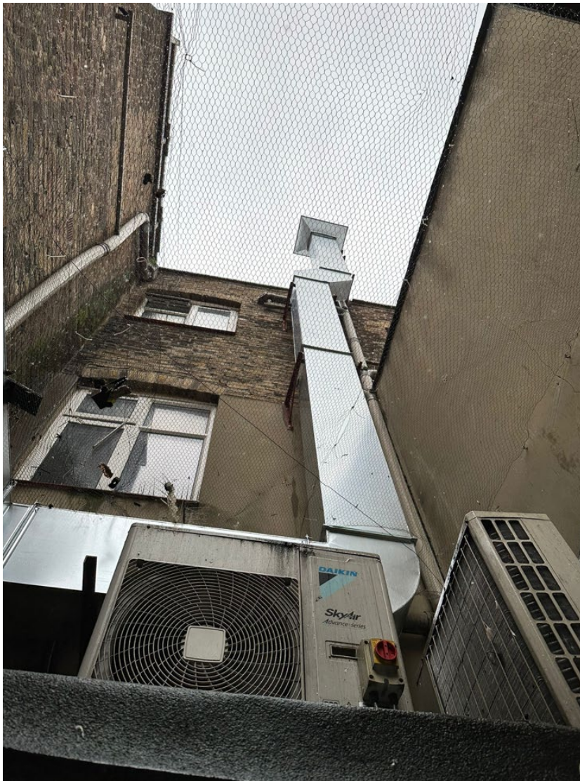
Photo 1 View of exhaust ductwork from yard