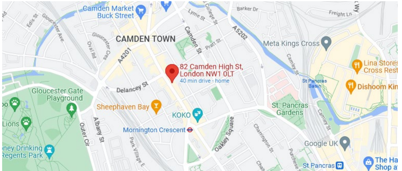
Figure 1 Site location ( maps.google.co.uk )

The area is generally mixed use on a primary high street, with commercial uses on ground floors, and residential at first floor and above in most buildings.