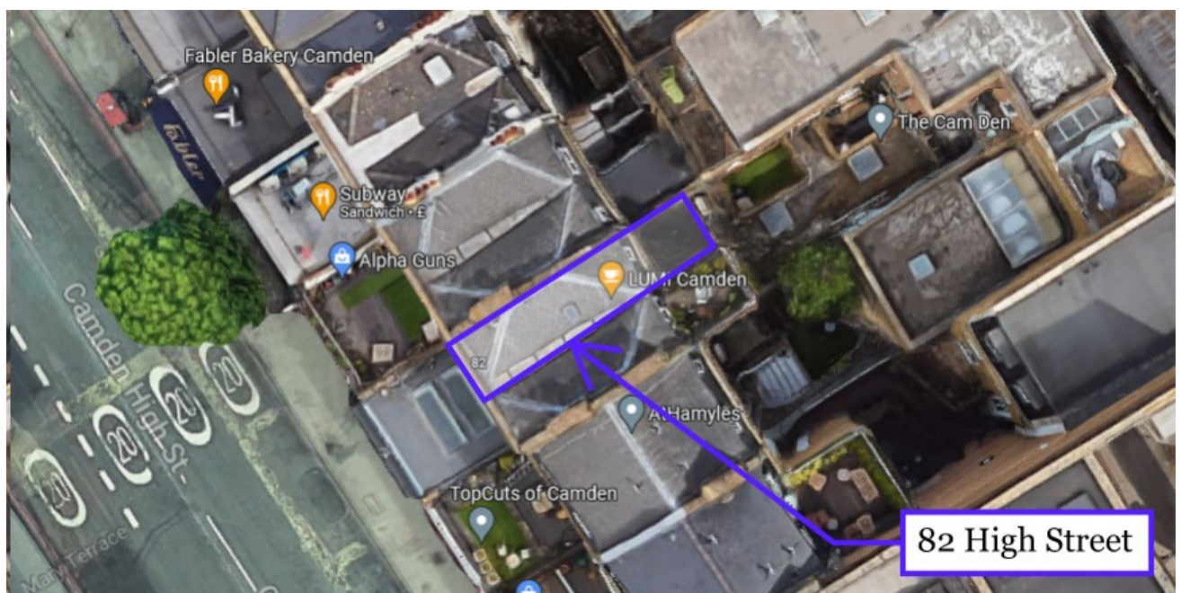
Figure 2 Satellite image

The site comprises a ground floor retail unit with residential apartments above. There is an enclosed yard/lightwell at the rear, in which the kitchen extract fan has been installed.