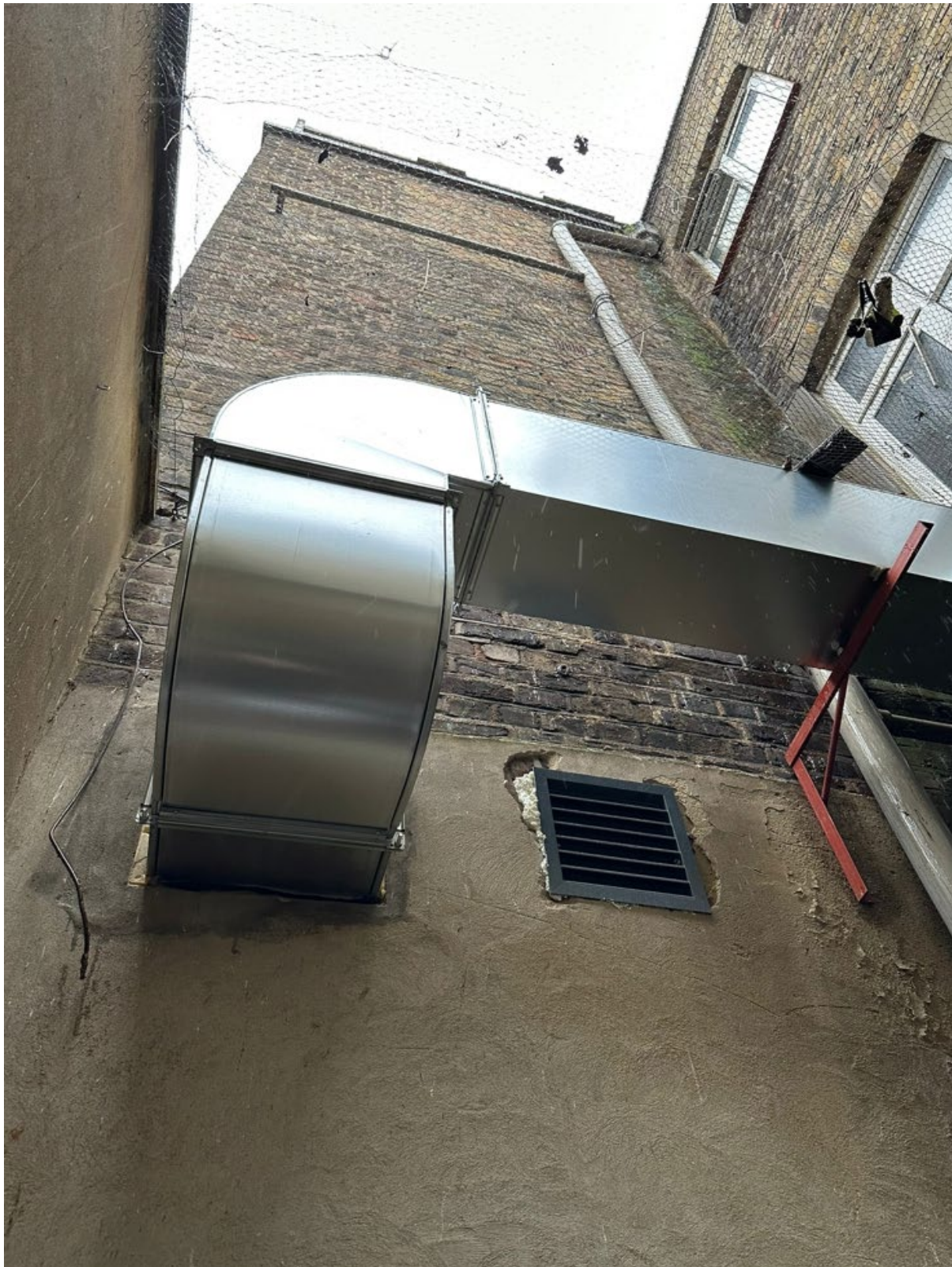
Photo 2 View of exhaust ductwork penetrating the facade